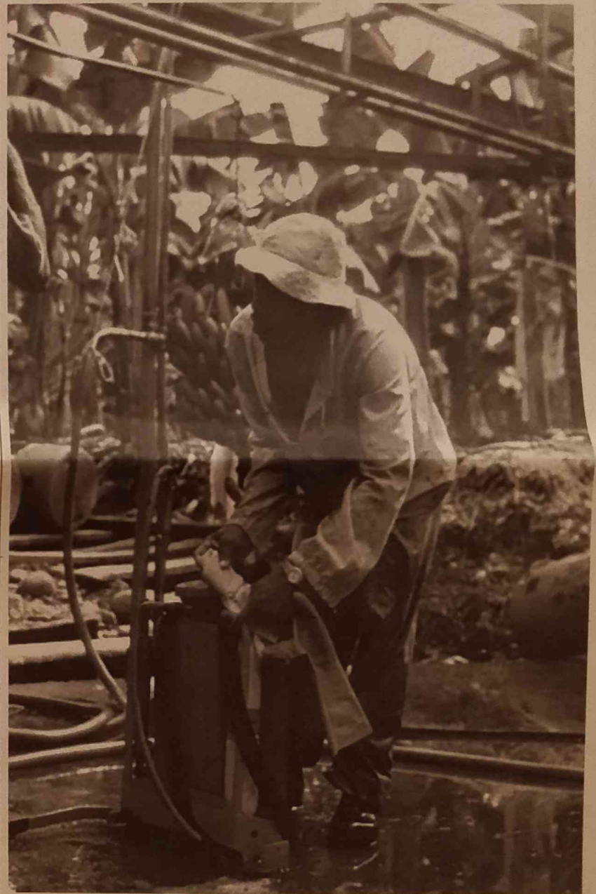
Dangerous – these banana growers have been working without any safety equipment

But the US is safe ... surely Del Monte state in their official US filings on pensions: "We sponsor non-contributory defined benefit pension plan, defined contribution plans, multi-employer plans and certain other unfunded retirement benefit plans. Retirees may also be eligible for