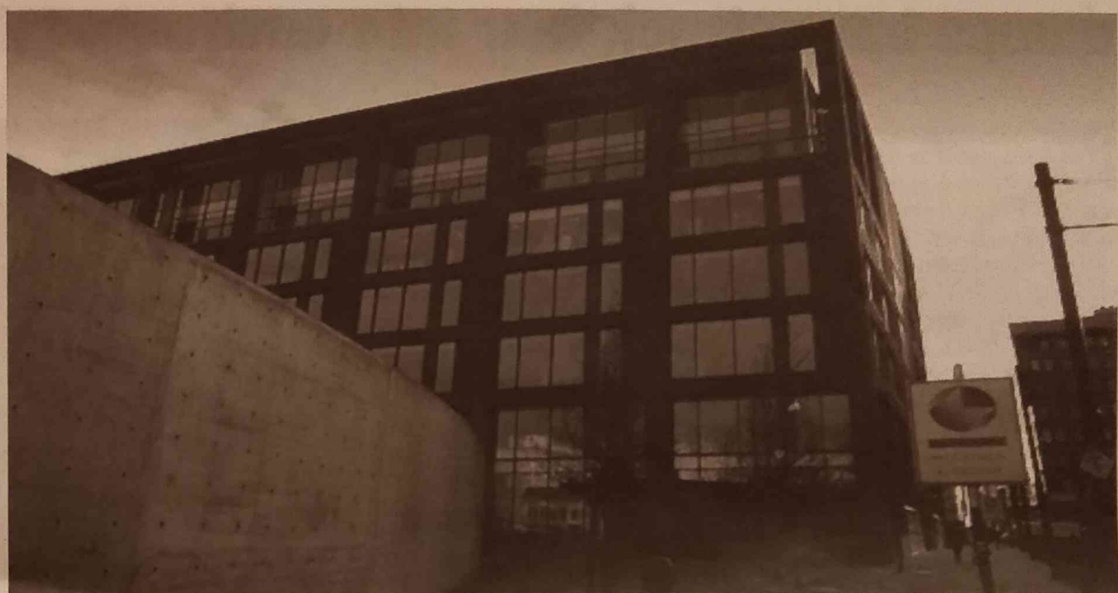
Finished, but Manchester Magistrates' Court stirred up a legal fight of its own