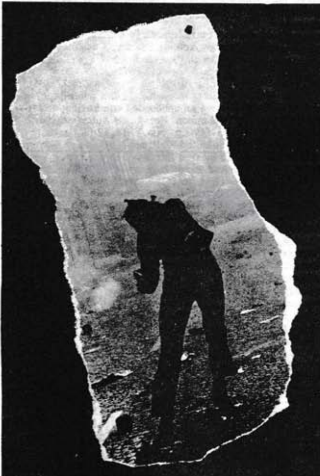
You don't have to be in the Army to fight in the war... French student Paris 1968.