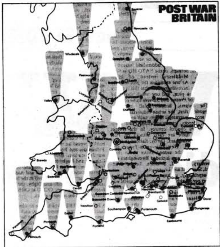
The 'Bomb Plot' of nuclear attack used in Square Leg. Open circles indicate airbursts which in general cause little fallout; black circles show ground bursts which are responsible for most of the fallout. Bombs usually in the range \frac{1}{2} -3 Megatons. Reproduced without the kind permission of HMG via 'New Statesman' 3/10/80

**Chaos is not of course synonymous with anarchy in the author's view, although a state of chaos may be necessary prelude. Only when people cease to rely on leaders and pyramidal modes of organisation, can anarchist forms of organisation evolve to meet our mutual needs.