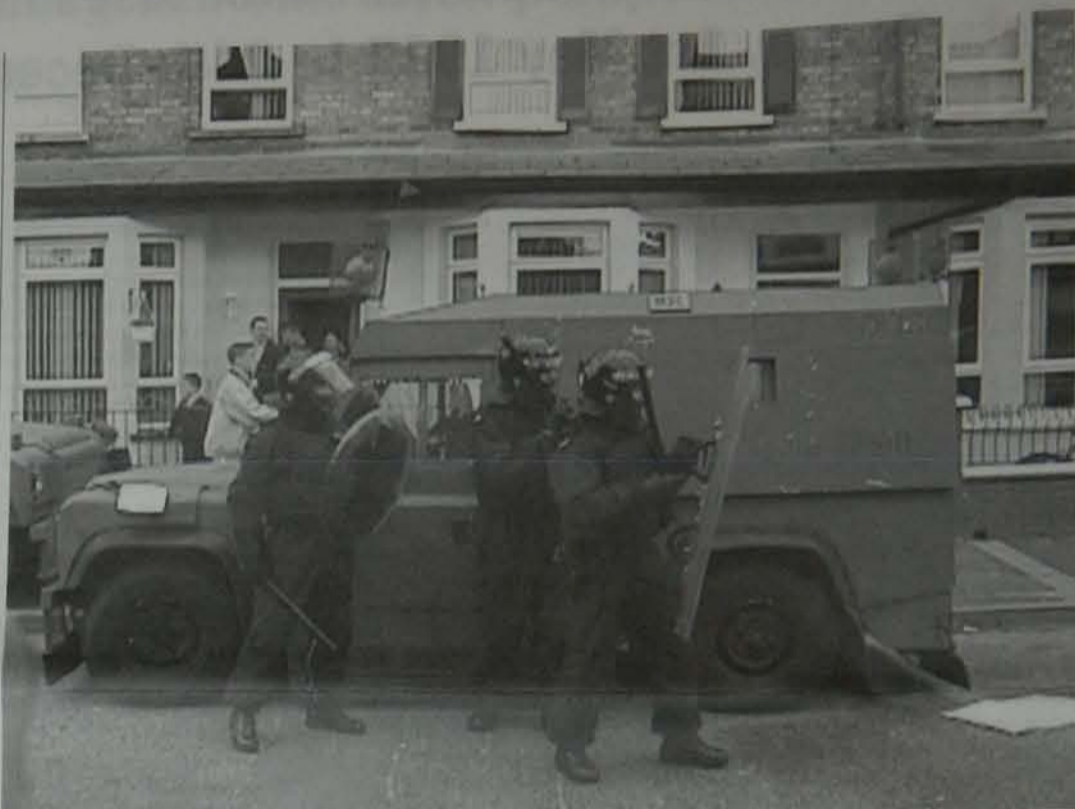
Respect Unity Coalition canvassing team in action

Unlike Marxist calls for a new electoral activity. The idea that socialists standing for elections somehow prepares for revolution is simply wrong – it only prepares people for following leaders. It does not encourage the self-activity, self-organisation, direct action and mass struggle required for a social revolution. There is nothing more isolated, atomised and individualistic than voting. It is the act of one person in a closet by themselves. Voting creates no alternative organs of working class power. And Marxists slander anarchists as being 'individualists'!