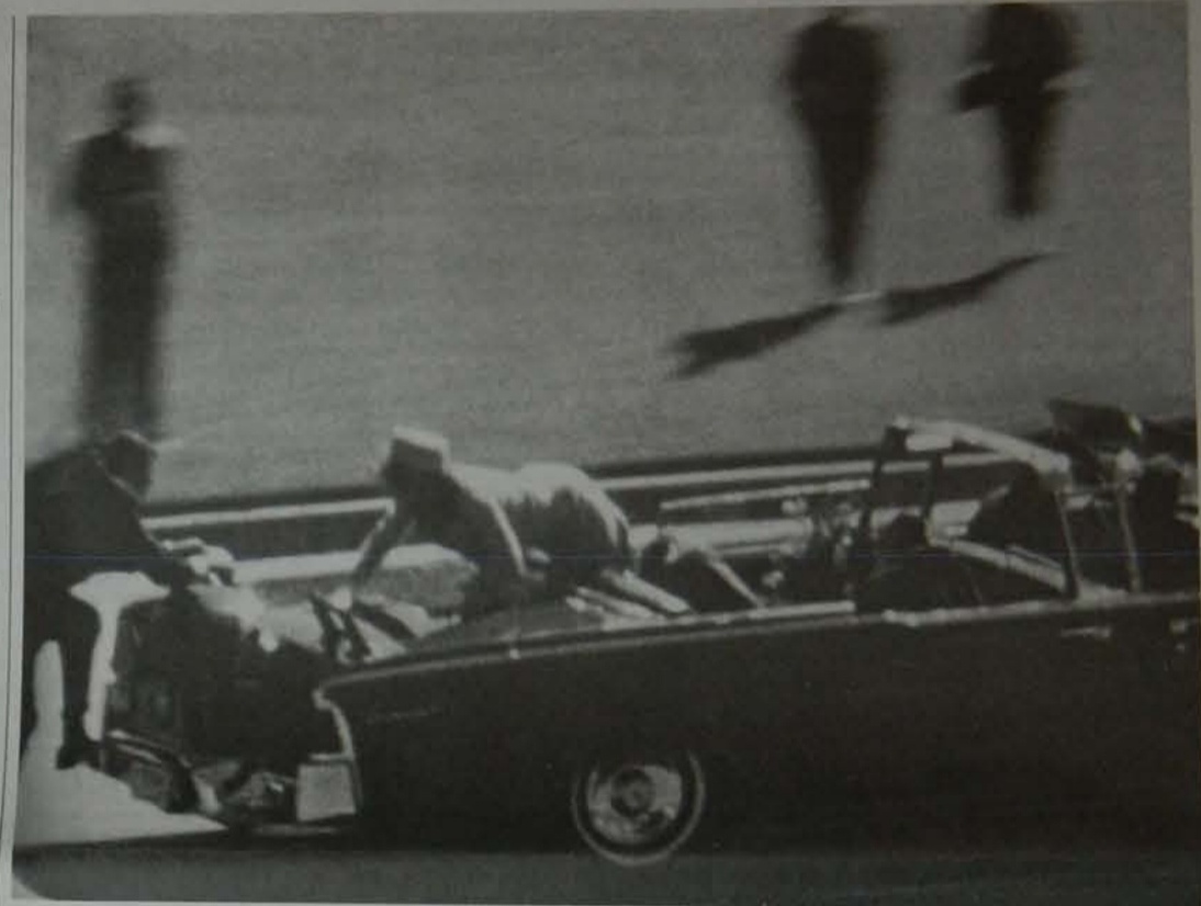
A conspiracy theorist's delight – JFK, still the original and the best

As for the material on the Columbine High School massacre – well, read it and see what you make of it. Like much in here, if it's true then we really have been lied to, big time. Sadly the collection