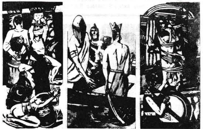
Departure , 1932-33 (Collection, The Museum of Modern Art, New York)

at the international Marlborough Gallery off Bond Street and as ever we drank of the wine while surrounded by what I would hold is no more than third rate work writ large. Let one be honest in this matter and state, that the national press have applauded John Wonnacott's work but like a postage stamp it is a type or style of work that improves the more it is reduced in reproduction. In face to face confrontation one has to