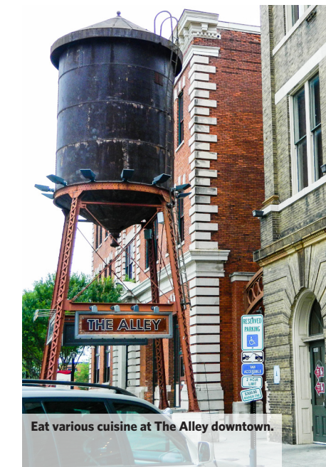
Eat various cuisine at The Alley downtown.