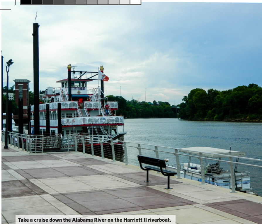
Take a cruise down the Alabama River on the Harriott II riverboat.