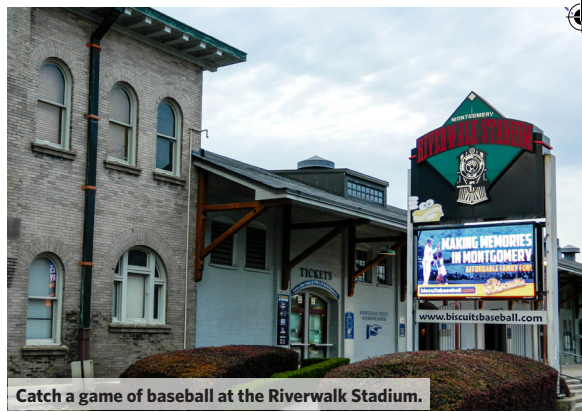
Catch a game of baseball at the Riverwalk Stadium.