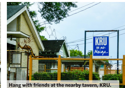
Hang with friends at the nearby tavern, KRU.