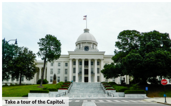
Take a tour of the Capitol.