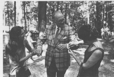
Alice Gerrard and Hazel Dickens with Bill Monroe, 1970.