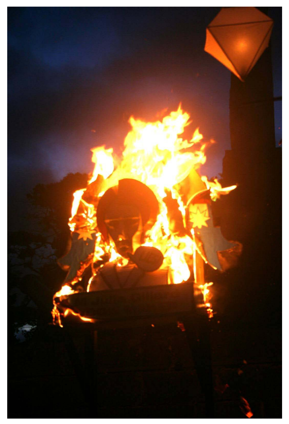
Illustration 12: Prime Minister Gillard burnt in effigy, Eureka Dawn Vigil (3 December 2010)