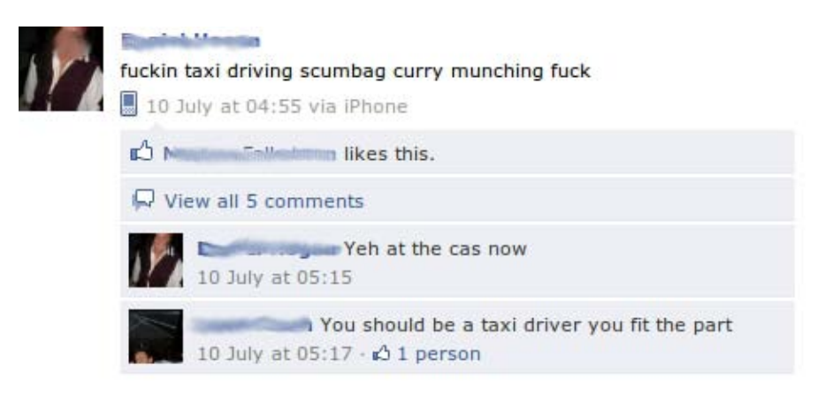
Illustration 11: Example of 'casual racism' on Facebook (user tags obscured)