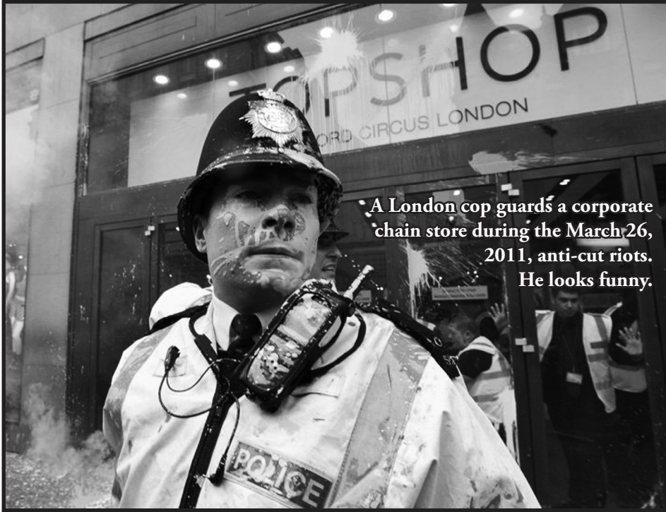
A London cop guards a corporate chain store during the March 26, 2011, anti-cut riots. He looks funny.

In late March, Mayor Mike McGinn publicly unveiled “SPD 20/20: A Vision for the Future,” a plan calling for the Seattle police to complete a list of twenty reforms within twenty months. This sudden, desperate ass-covering was the City’s response to the Department of Justice’s unsurprising confirmation of a pattern of excessive force and civil rights violations within Seattle law enforcement practice. The DOJ’s message was simple: shape up or face a federal lawsuit.