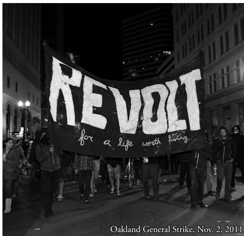
Oakland General Strike, Nov. 2, 2011

Blockades and direct actions ongoing all day. For up to date information: may1stseattle.org