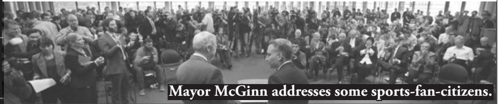
Mayor McGinn addresses some sports-fan-citizens.

Brief reports from the bowels of the city.