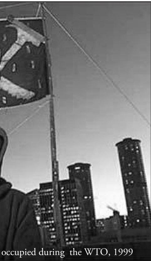
occupied during the WTO, 1999