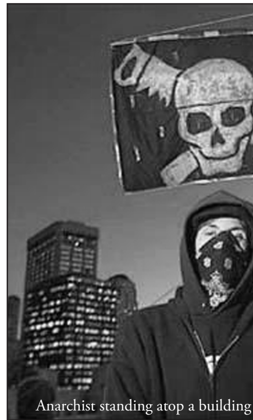
Anarchist standing atop a building

strong, the members navigated and agitated inside the growing links between the anti-globalization movement and the environmental movement. At the time, the potential for a mass revolt against global capitalism seemed pos-