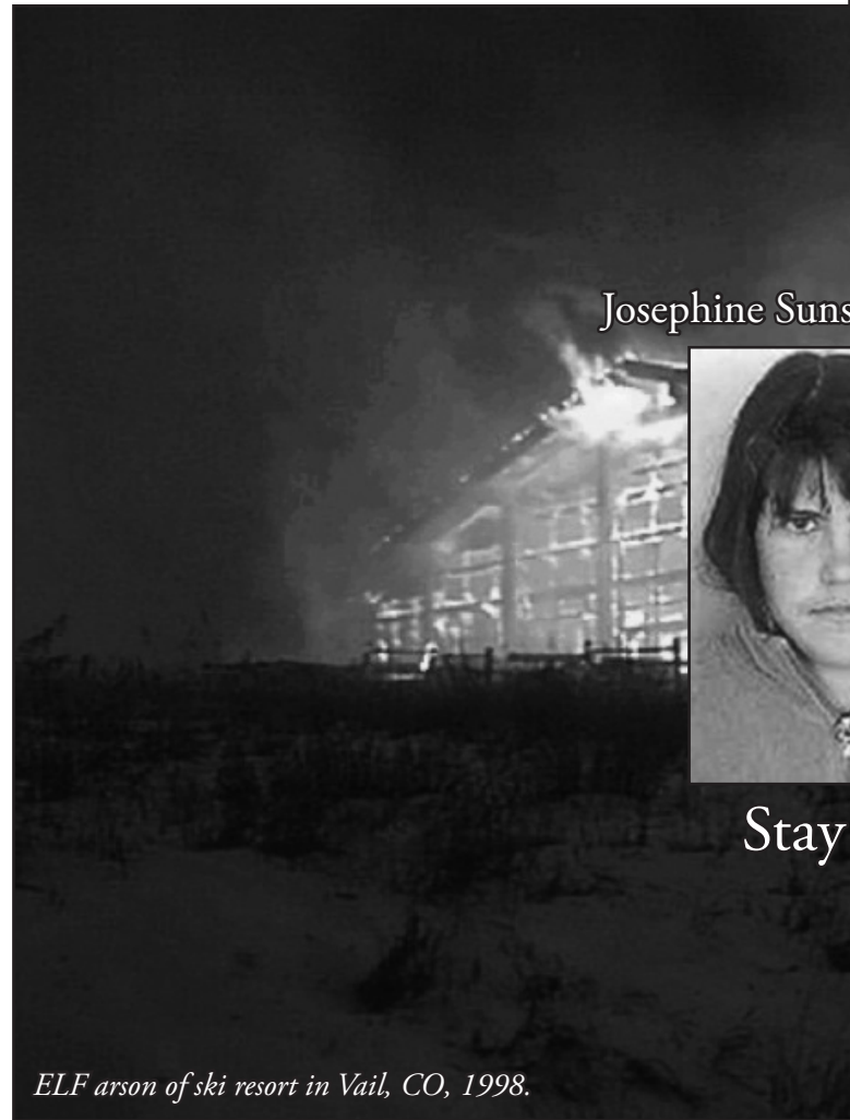
ELF arson of ski resort in Vail, CO, 1998.

In 1997, different ELF cells that did not know each other carried out attacks in Utah against a fur-breeding plantation