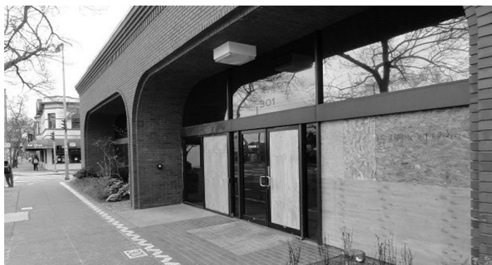
Boarded-up windows at Chase Bank after the attack

for the proliferation of the attack, -some anarchists