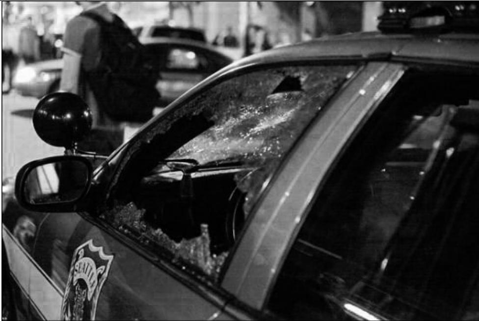
Rowdy queers smashed out the windows of two police vehicles during the third annual "Queers Fucking Queers" street dance party in Seattle's Capitol Hill on Saturday, June 25th.