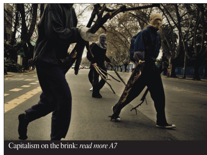
Capitalism on the brink: read more A7