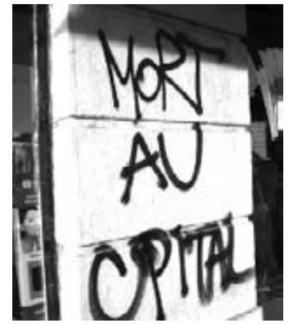
Unsurprisingly COP15 was another white wash.

The fundamental aim of COP15 negotiations was to find ways to fund businesses who continue to pollute the planet and make outrageous profits by robbing poor to pay for their excesses. Its no surprise to me that Climate Change Policies and Treaties (supposedly designed to address real emergencies, like rising sea levels, for peoples like the Kiribati) are being used to facilitate and create the structures for a new round of capitalist. primitive accumulation imperialist where wealthy nations and multinationals accumulate profits off the backs of poor, and indigenous communities around the world).