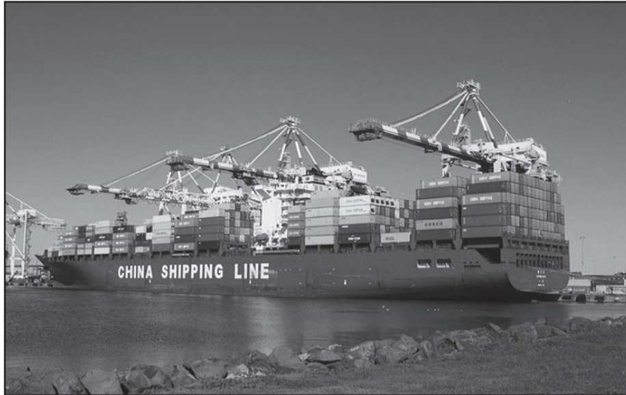
Swanston Dock Melbourne

ISDS clauses undermine the national sovereignty of countries. Governments that accept them betray the interests of their people.