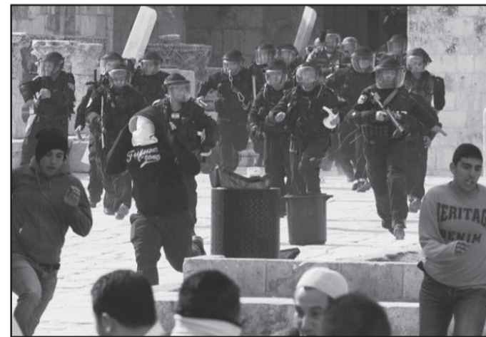
Ever expanding settlements in East Jerusalem and the recent Zionist incursions into Al Aqsa Mosque have intensified Palestinian resistance