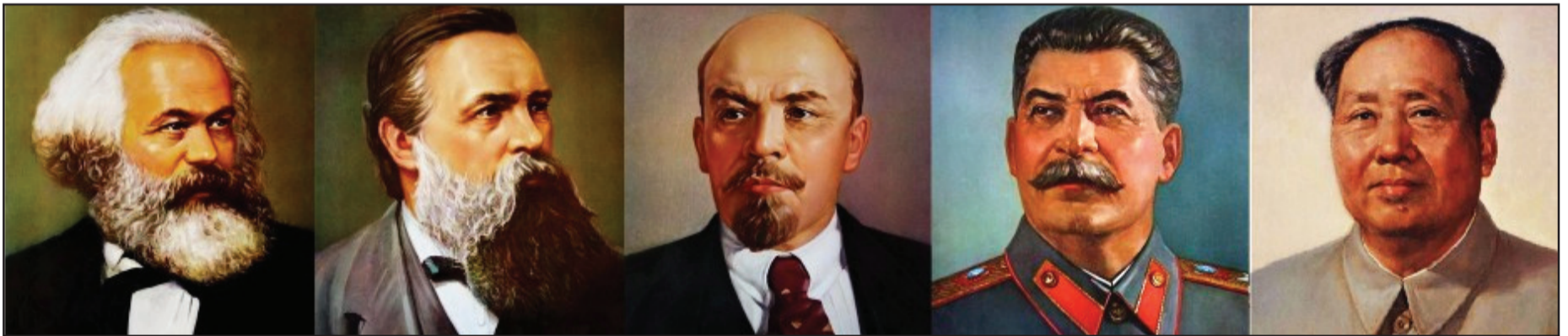
Marx, Engels, Lenin, Stalin and Mao: Unity of theory and practice in marking out the path towards a society without class

Communists have a vision of a future society that has no need for hierarchies or weapons. “State interference in social relations becomes, in one domain after another, superfluous, and then dies out of itself; the government of persons is replaced by the administration of things, and by the conduct of processes of