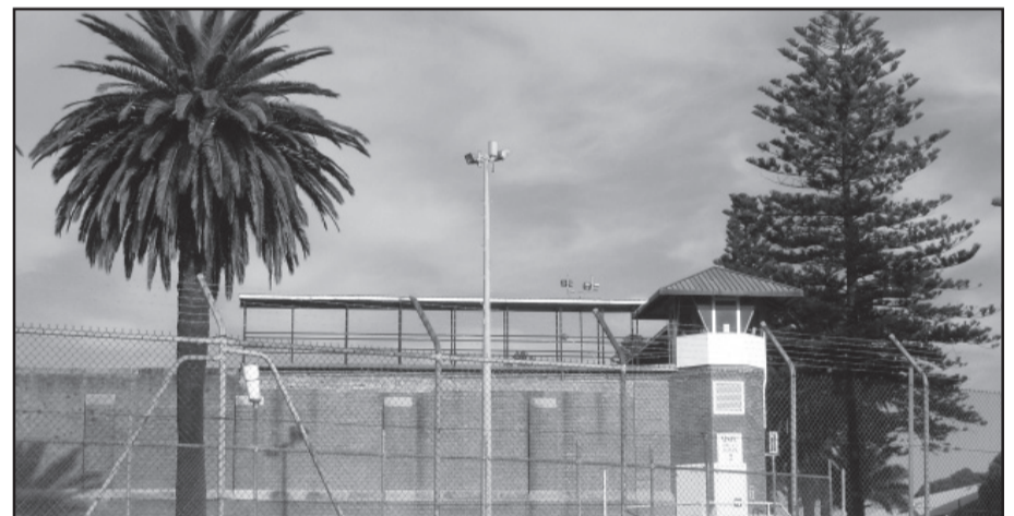
Long Bay Prison in NSW