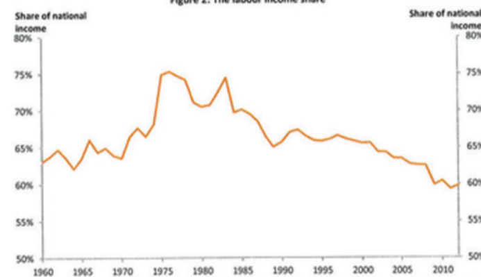
Figure 2: The labour income share

Source: ACTU calculations based on ABS 5204, ABS 6291.0.55.001, Butlin 1977. Chart shows total labour compensation, including employers' social contributions and the imputed labour income of the self-employed, as a proportion of total factor income.