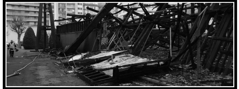
GRENOBLE, FRANCE 22.01.19: It pleases us very much that we are seeing many symbols of the State and capitalism being attacked lately, that rage turns into action. Even if their motives sometimes contradict our own ideas, we know that we don't have allies everywhere, so it's always beautiful when there are clashes in the cities and the countryside.

A thought for those who take advantage of these moments to destroy without moderation and without demands. Another for those who do not wait for these opportunities to destroy everything.