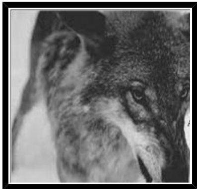
Anti-Left Anarchy: Hunting Leftism with Intent to Kill by anonymous

Ignore these facts we may, they continue to come back to haunt us in the unarticulated precarity of our helpless dependence, the interpersonal violence, the deadly sadness. Self-medication doesn't cut it. Reality TV can't mask it. The chatter of the crowd won't drown it out. We are under mental and physical occupation by the capitalist-industrial system, leaving the firm but false impression of there being no outside, no choice, no escape. Is this really what we could call living? ~