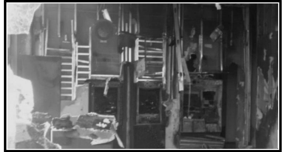
BUENOS AIRES, ARGENTINA: Responsibility Claim for the Explosive Attack Against a Santander Rio Bank Branch

I wondered how it was that white people were simultaneously supposed to 'shut up and listen', 'make space for POC', 'don't speak for POC', but also 'put