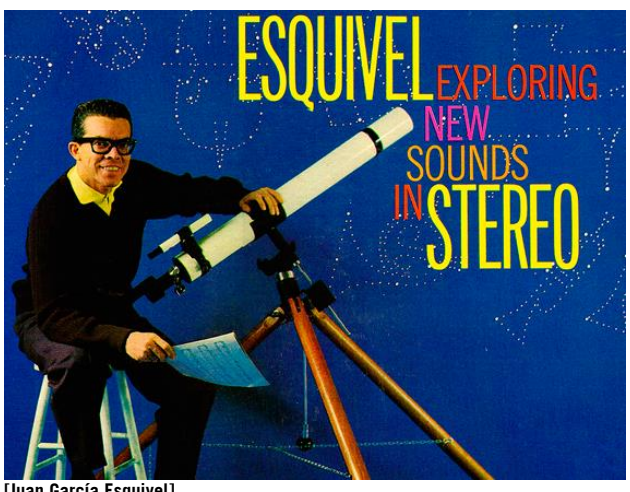
[Juan García Esquivel]

pingy, with maximum stereo separation. Hi-fi was a medium of maximum sensation, and it loved percussion.