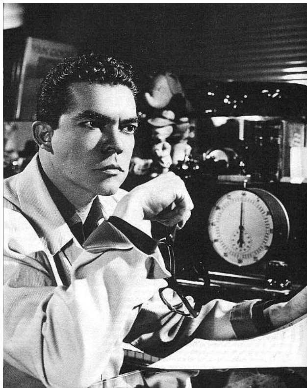
[Juan García Esquivel]

Globokar's Phonic Arts ensemble, is the one that makes most sense to me. It's a piece, which – like many from that period – involves a lot of improvisation.