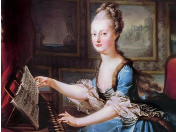
[A lady playing a harpsichord]