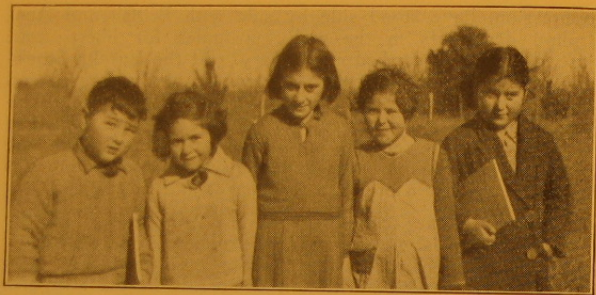
Children of Jewish refugees who have settled on the land near Shepparton (Victoria).