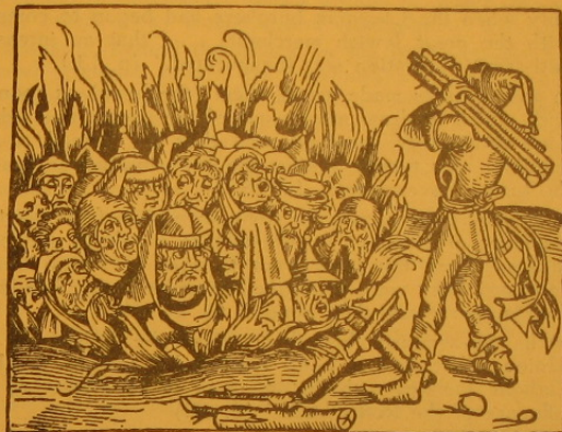
A MASSACRE OF JEWS.