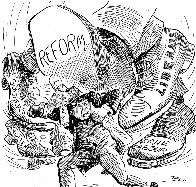
Post-war cartoon by William Blomfield. NZ Observer , 13 December 1919, National Library of New Zealand

For those in power monitoring these developments, the possibility of a general strike seemed imminent. Recorded industrial disputes had risen from 8 in 1915 to 75 in 1921. As a result, Prime Minister Massey urged his Reform party faithful to “secure good men to stem the tide of Anarchy and Bolshevism.” This radical tide, complained Massey, “is worse than folly... the matter must be taken in hand and stopped.” 50