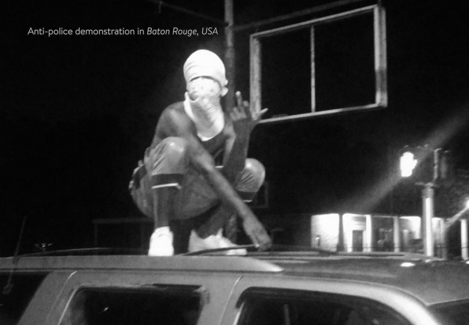
Anti-police demonstration in Baton Rouge, USA