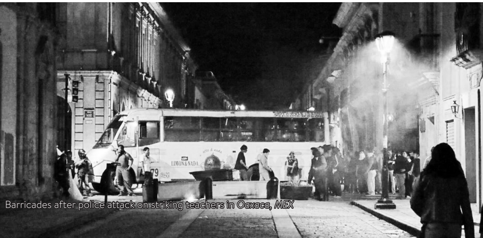
Barricades after police attack on striking teachers in Oaxaca, MEX