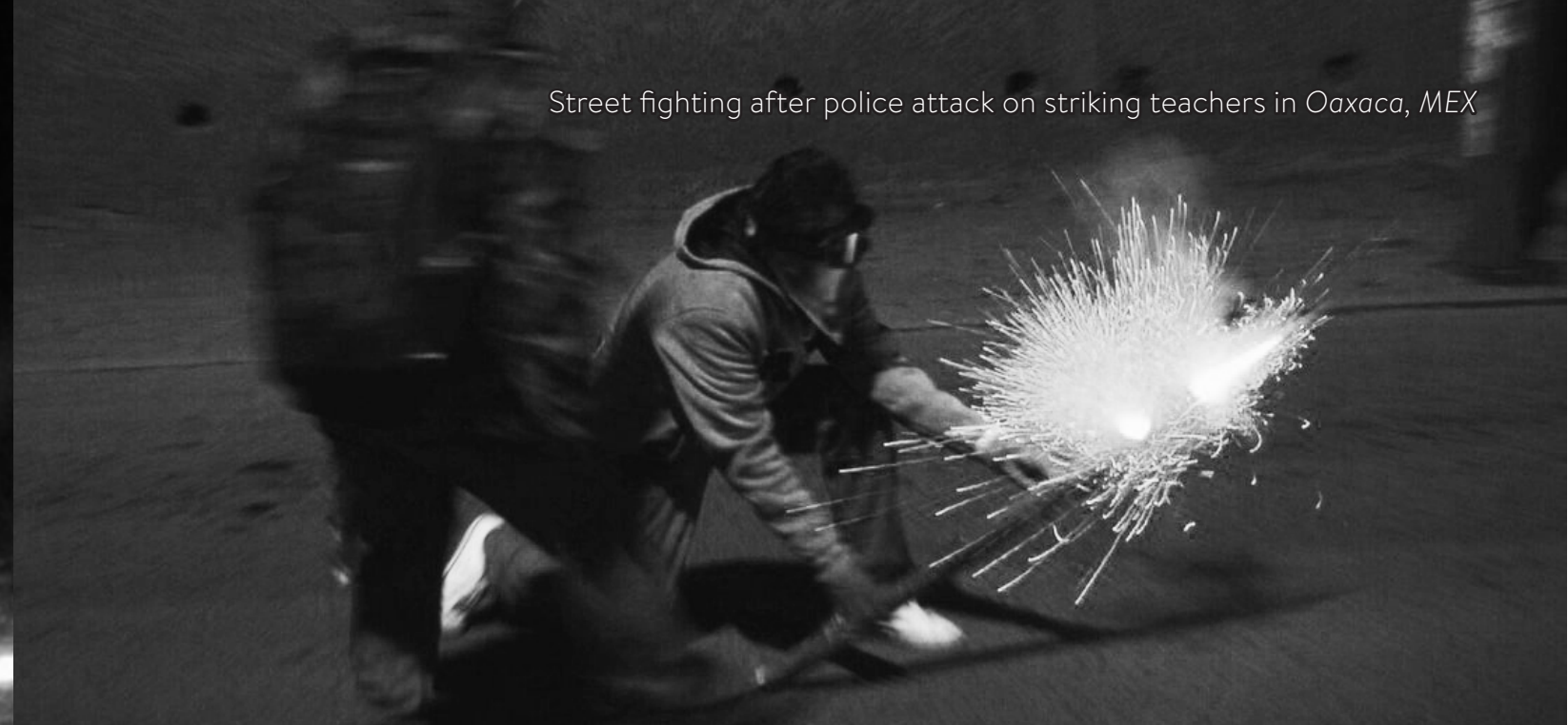
Street fighting after police attack on striking teachers in Oaxaca, MEX

In a broader sense, it's also worth noting that in quick secession, a large American population just experienced first-hand three of the most paradigmatic phenomena of our times: an anti-police uprising, a mass-shooting, and a climate-related catastrophe. Taken together we have a neat diorama of the existential disaster capitalism has thrown us into. For those of us actively looking for a line of flight from this catastrophe — especially in the South — the events unfolding in Baton Rouge are very instructive.