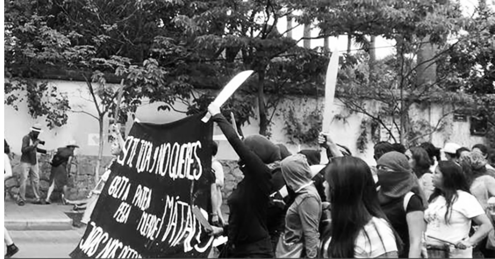
Top: Anarcha-feminist demonstration in Oaxaca, MEX

Front top: Log loader sabotaged in British Columbia, CAN Front middle: Car burned during anti-police riot in Milwaukee, USA Front bottom: Clashes on the anniversary of the Ayotzinapa students' "disappearance" in Chilpancingo, MEX Back top: Barricades block police movement as the summer's revolt spreads across Oaxaca, MEX Back bottom: Cars are burned and stores are looted during anti-police riot in Montreal, CAN