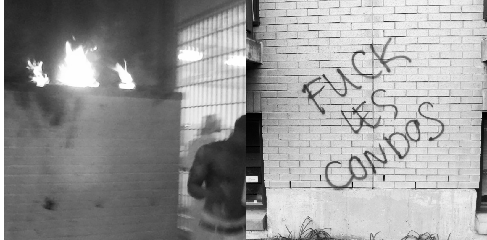
Top left: Prisoners set fires after taking control of their dorm at Holman prison in Alabama, USA