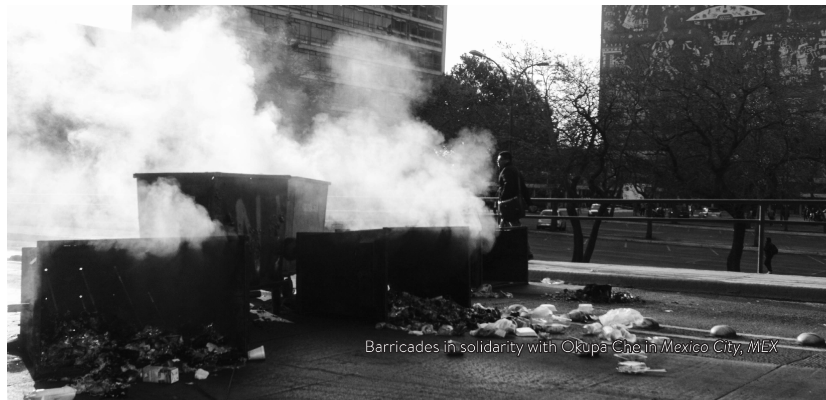
Barricades in solidarity with Okupa Che in Mexico City, MEX

Some anarchists from the Mexican region, February 26, 2016