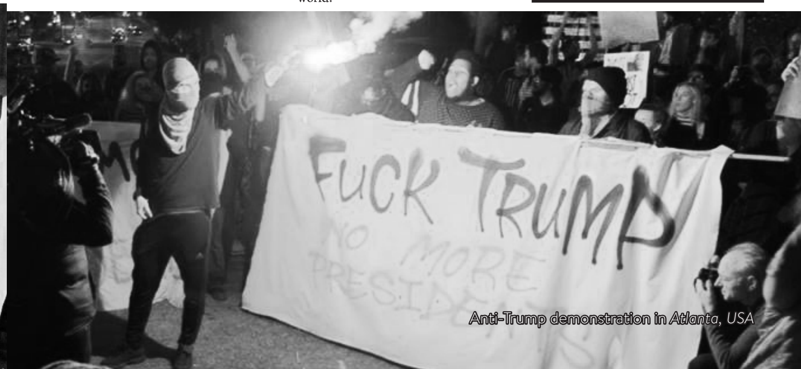
Anti-Trump demonstration in Atlanta, USA