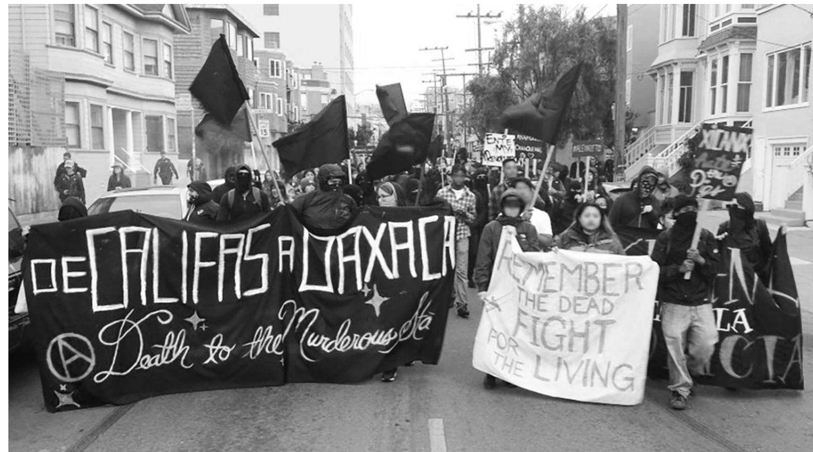
Bottom: March in solidarity with the uprising in Oaxaca takes to the streets in San Francisco, USA