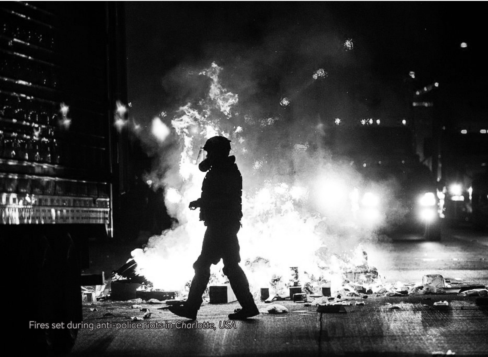
Fires set during anti-police riots in Charlotte, USA

Its necessary to know them, to understand them. The processes that unfold are interesting, like many practices, activities, understandings. Many comrades who struggle there demonstrate an impressive courage and persistence. But more of a critical perspective (that we invoke everywhere else) is essential. At least we don't want to continue to visit communities where it happens that we, anarchists, are quietly served by women, where we kindly assist elder's councils (which in the demagogic language transforms into "assemblies") or