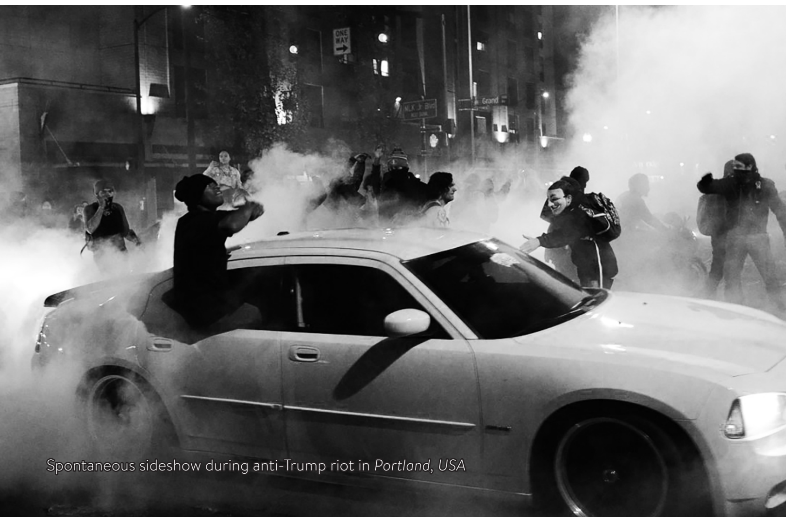
Spontaneous sideshow during anti-Trump riot in Portland, USA