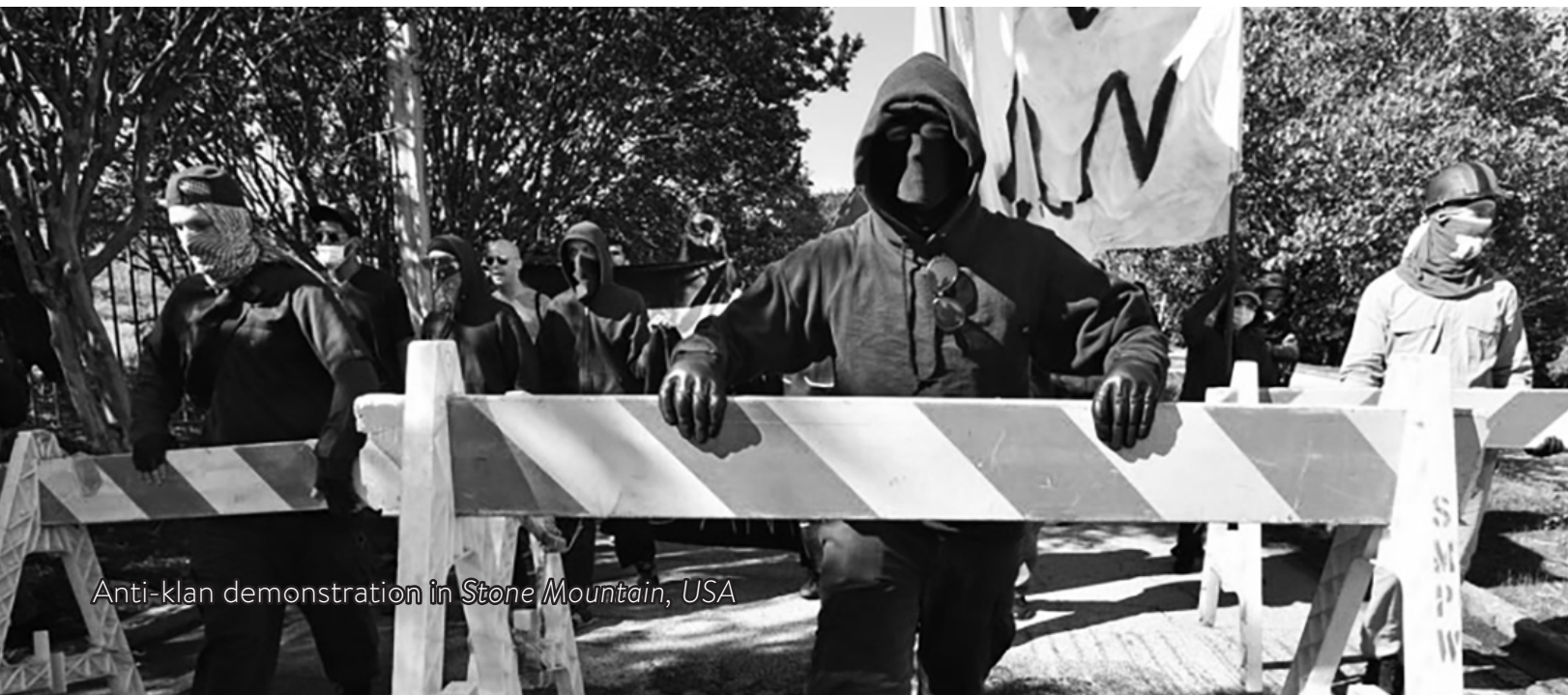
Anti-klan demonstration in Stone Mountain, USA

In the current national context where impunity for the Mexican state's crimes