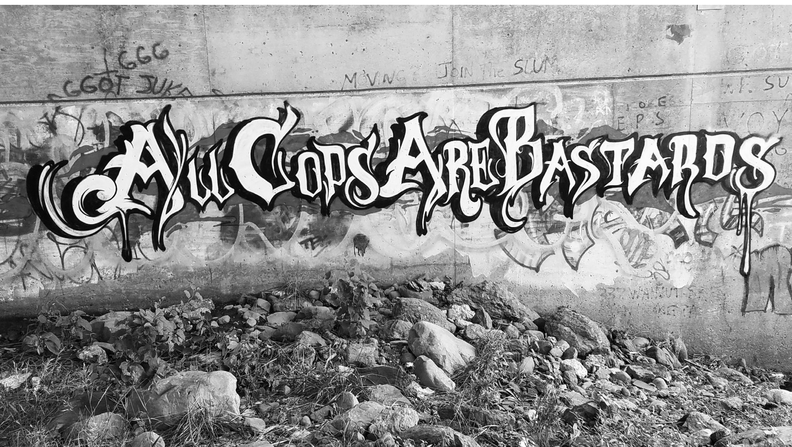
Bottom: Graffiti painted in Pennsylvania, USA