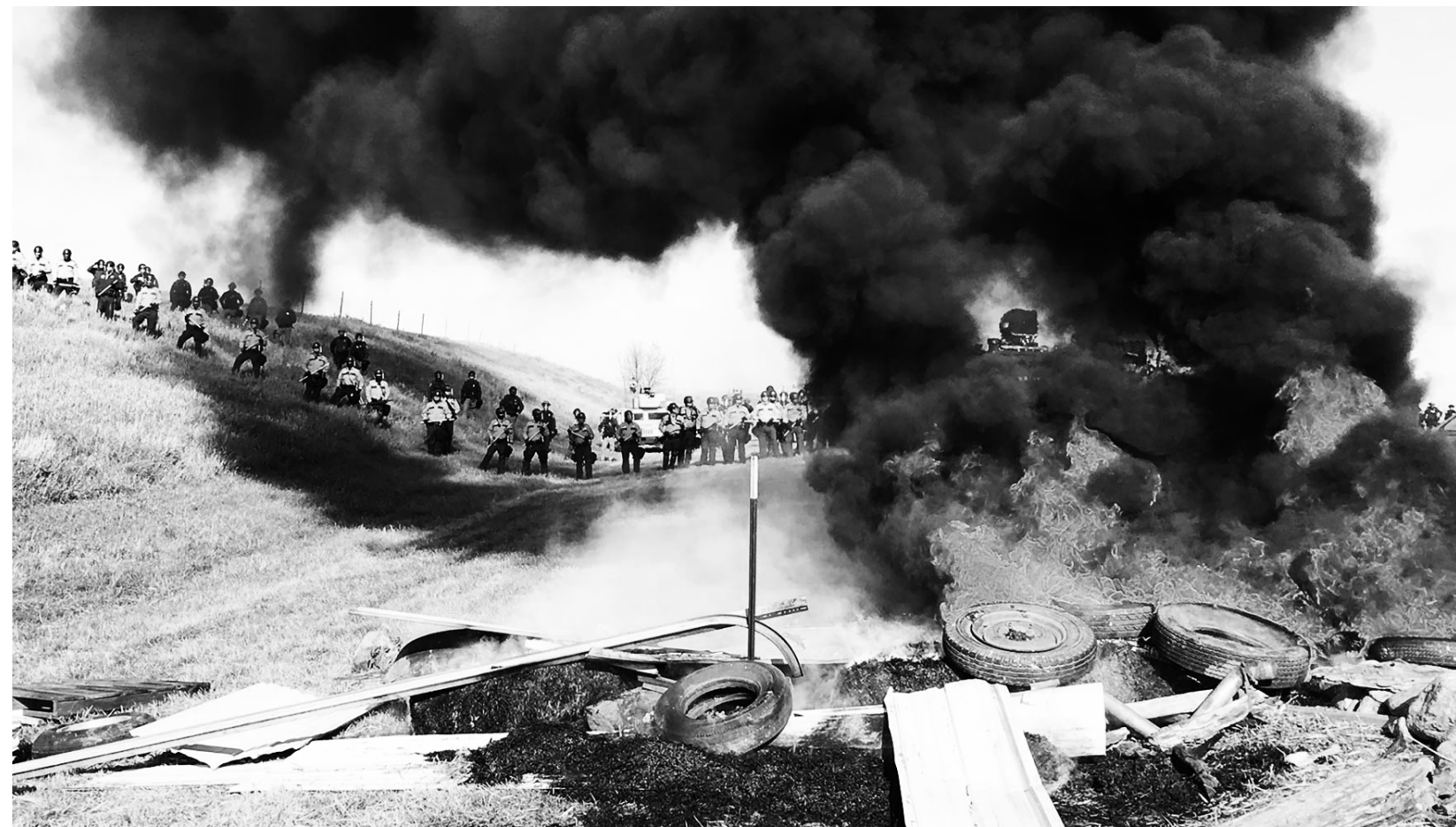
Bottom: Barricades burning during eviction of Sacred Ground camp in Standing Rock, USA