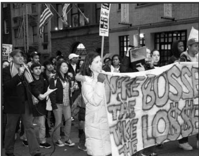
New York March against the budget cuts.

The Progressive Labor Party has been and will be at the forefront of working-class struggles. We are a Party for the masses, and it is through this militancy of international working-class solidarity that we can hope to smash capitalism and build a communist world.☺