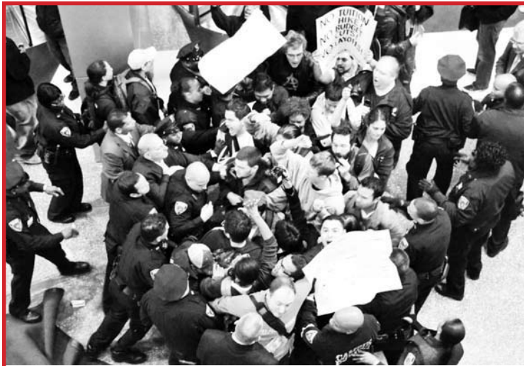
Students, professors battle CUNY bosses' tuition hike.

earthquake relief fiasco in Haiti, the Pakistani government, the UN, and boss-funded NGOs lined their own pockets with donated relief money. PLP also played a key role in organizing protests across Pakistan to expose the flimsy World Bank-funded dams, and ultimately the capitalist system, as responsible for the scale of death and destruction, while unmanned U.S. military "drones" continue their Nazi V-2 rocket-style slaughter from the sky.