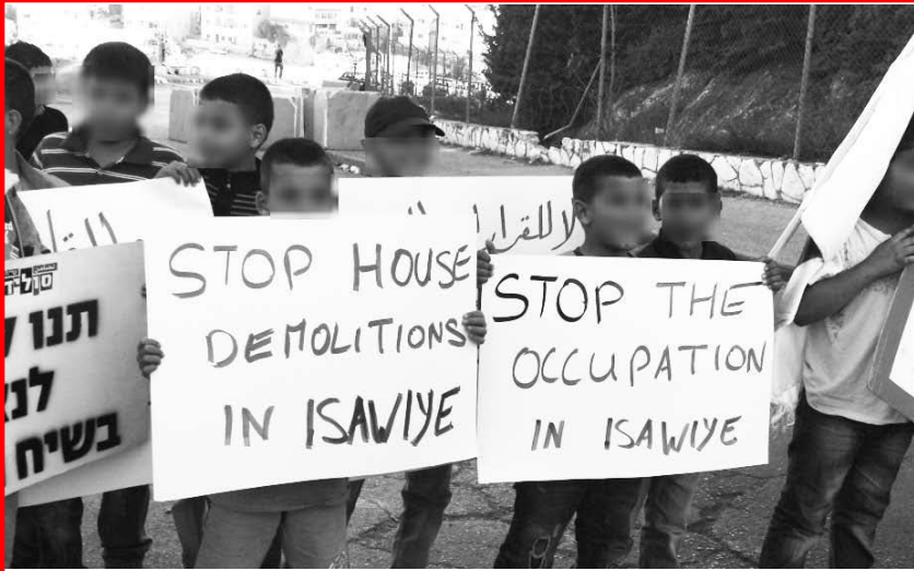
Jewish and Palestinian youth defy racist cops.