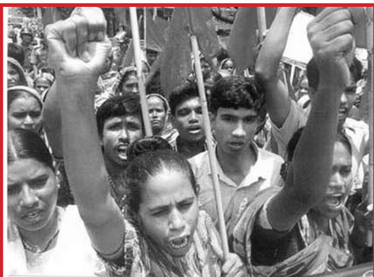
Garment workers in Bangladesh defy pay-cuts.