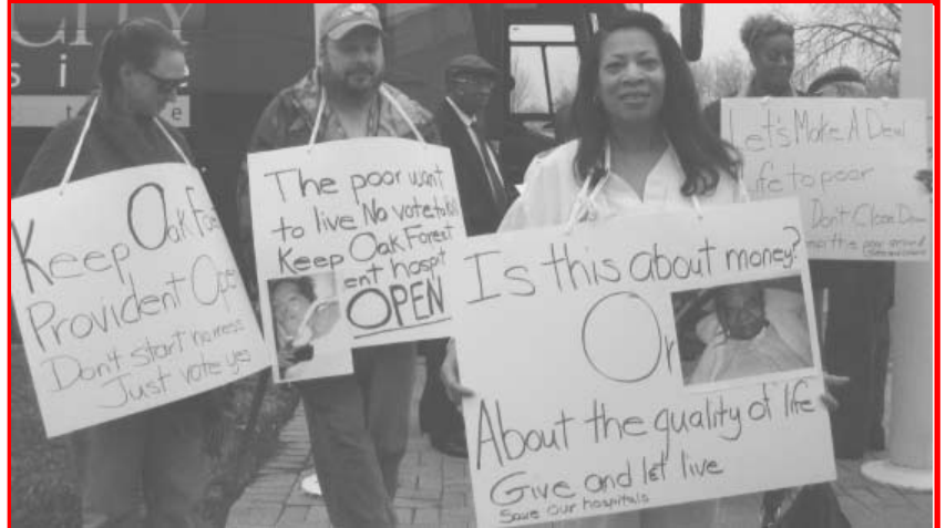
Workers, patients, youth unite in Chicago to fight racist hospital cuts — murder the Nazi way.

WASHINGTON, D.C. — PLP comrades and friends active in the struggle for housing for workers infected with HIV/AIDS surrounded and seized unused government land. Braving the threat of police attacks, they built a tent city to call out the city's bogus promises for affordable working-class housing. PL members argued that while land seizures like this are invaluable to raise militant class struggle, only seizing state power through armed revolution will ever guarantee decent housing for the working class. In the U.S. capital, 3% of the total population is infected with HIV, on par with Uganda. For black men, it is more than double at 7%. According to the U.S. Center for Disease Control, a 1% rate of infection constitutes a "generalized and severe epidemic."