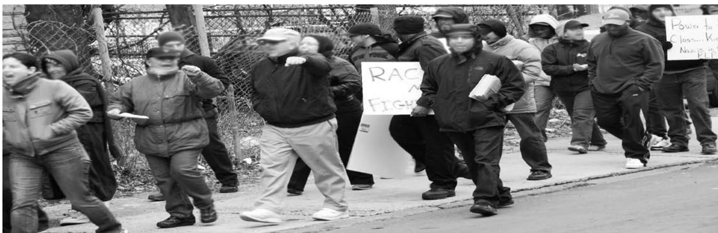
Marching to the Trenton's working-class community with communist vigor.

PLP is correct when we say "no free speech for racists" because the bosses need a fascist movement. The last time the Nazis were given free reign to organize, over 100 million men, women, and children died during World War II. The Red Army smashed the Nazis before, and we in PLP work hard to smash them again.✪