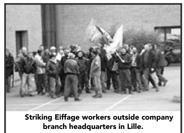
Striking Eiffage workers outside company branch headquarters in Lille.

This strike showed once again that workers are fighting giant monopolies and the latter's government, protecting a financial oligarchy. The choice that global capitalism puts before the working class — given that unions work within this system — is either "put yourself at the mercy of capital and sink lower and lower" or "adopt a new weapon." This weapon is the revolutionary communist Progressive Labor Party. We need to build the PLP whose aim is to destroy a system that offers such phony "victories" and erect one that is run by and for the working class, in which workers collectively reap all the value that our labor creates. ☸