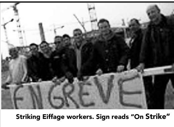
Striking Eiffage workers. Sign reads "On Strike"

PARIS, April 15 — Construction workers here have won an illusionary "victory" against Eiffage Construction and Eiffage Public Works, two subsidiaries of the country's third-largest construction company. A two-week strike brought an overall 2% wage "increase," which is no increase at all given a 2% inflation rate over the past year, which meant a wage-cut for those workers awarded a 1.7% hike.