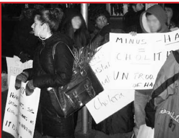
Rally backs rebellion in Haiti against U.S./UN oppressors.

opian-Jewish cleaning workers after an anti-racist struggle at a university in Rehovot. They organized against the fascist demolition of the Palestinian-Bedoin village of Al-Araqib for a wealthy Jews-only gated community. They marched with the red flag. CHALLENGE and Hebrew translations of PL literature in Tel-Aviv followed the Israeli massacre on a Turkish supply ship headed to Gaza, and in East Jerusalem against a racist land grab of rich Jewish settlers in the Silurian neighborhood.