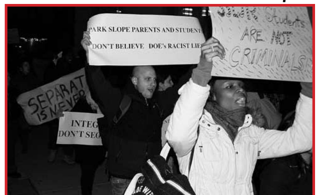
Brooklyn, N.Y. — John Jay H.S. students, parents, teachers fight bosses' racist re-segregation of schools.