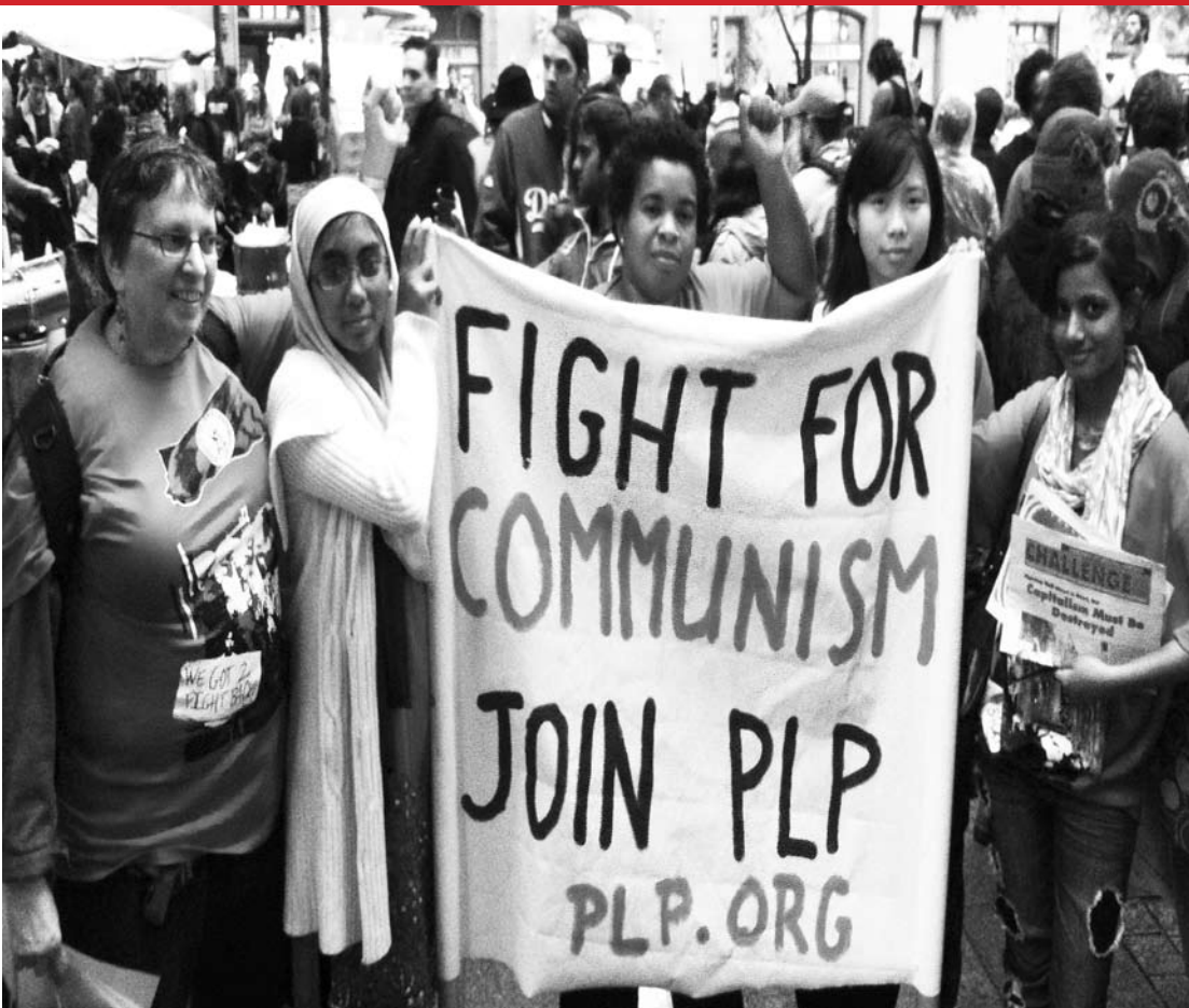
Multi-racial worker-student solidarity at New York City's Zucotti Park.

NEW YORK CITY, October 17 — Occupy Wall Street (OWS), spreading across the U.S. and worldwide, holds both promise and danger for the working class. It's now clear that large numbers are seeking an end to the profit system's misery and injustice. At the same time, Obama and union misleaders are embracing this protest for their own reasons. For the capitalists, OWS represents yet another ruling class effort to funnel workers' anger down the dead-end road of reforming capitalism, especially through electoral politics (see page 2).