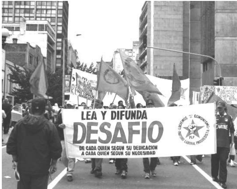
PLP contingent in Bogota, Colombia May Day march.

failed to agree on a bill, Bush is trying to resurrect it and it may very well return with many of its original provisions. One of these states that those who do qualify may have to pay retroactive taxes. At this moment it is unclear whether that means payment from the time they started working in the U.S. to the present. Even if it was for, say, the last three years, it would mean for every year of non-payment of taxes, there would be a 15% penalty on the amount of income that was declared.