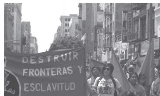
May Day 2007 in Los Angeles

Capitalist-created borders have had disastrous effects. For 60 years, Israeli and Palestinian workers have been marching behind their rulers to their deaths. "Undocumented workers" in the U.S. and Europe face massive repression because they're from different countries. These bosses' borders divide workers and induce them to pledge allegiance to their local ruling class, maintaining the latter's class rule.