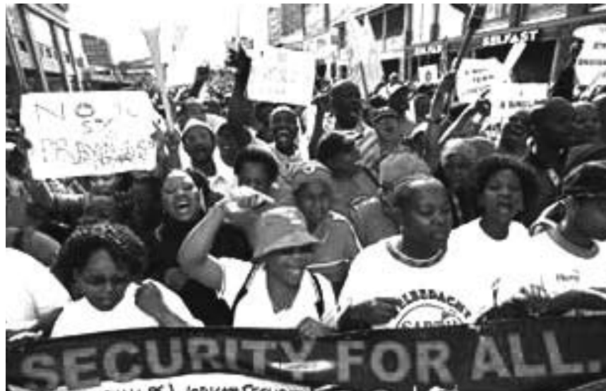
Half a million workers went on general strike.

How did these forces who fought Apartheid become the best guardians of capitalism? Millions of workers and youth in South Africa and worldwide opposed and fought the super-racist Apartheid regime and its capitalist and imperialist backers, who made huge profits off the racist super-exploitation of the black workers here. Many of these anti-racist fighters wanted a communist-led revolution to smash capitalism, the source of racism. But the ANC and SACP leadership were not organizing