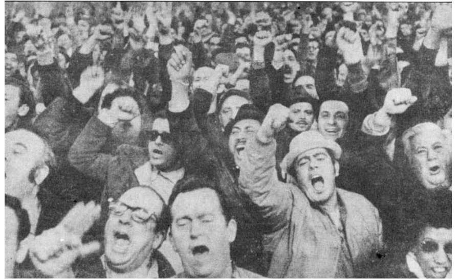
1970 Postal Workers Chant: "STRIKE! STRIKE! STRIKE!"

With 37 years of hindsight, we can make a sober, balanced self-criticism of our inability to rise to this occasion. Part of the problem was objective. SDS was primarily a single-issue organization, whose dramatic rise was tied to protesting the Vietnam War. Vietnamese workers and peasants were being sold out, and the anti-war movement was dying at the time of the postal strike, although it had not yet become conscious of its demise. Leading massive