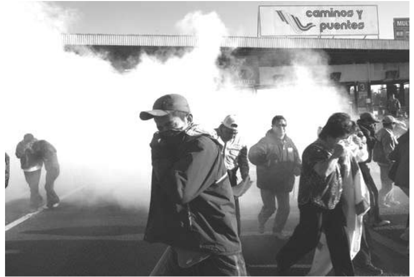
Mexico, June 1: Cops attack with tear gas protesting teachers who tried to take over toll booths on the Mexico City-Cuernavaca highway.

The WSJ emphasizes that "the fact that Vietnam is controlled by the Commu-