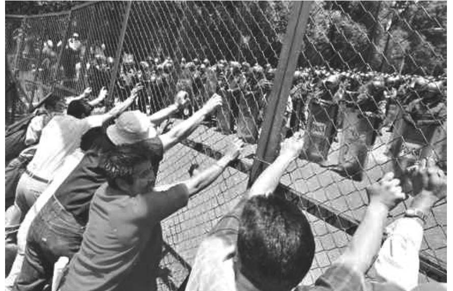
Angry teachers attack fence surrounding the presidential palace

Afterwards, PLP members and friends held a social-political event. We urged all to participate with us in coming activities, including June 14, the first anniversary of the cops' brutal attack repelled by the militant teachers, and which sparked the long mass Oaxaca rebellion. Our goal is to massively spread the need to build an inter-