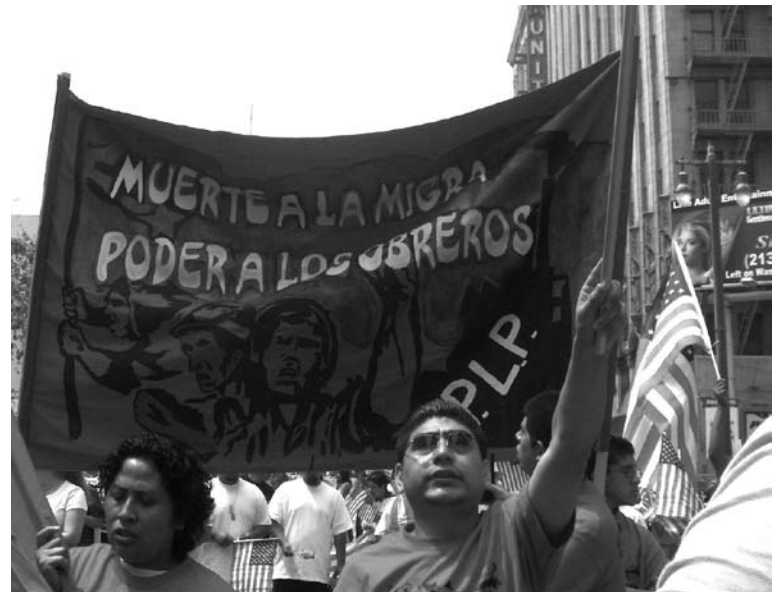
Los Angeles May Day, 2007

This is part of a growing trend in the use of the universities to build up homeland security forces and prepare for wider wars. As inter-imperialist rivalry grows, the bosses must adjust their resources, finding new ways to gain from the exploitation of workers. On this campus, millions have been invested in the new lab, while many other sections of the schools fall apart and