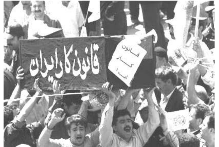
During May Day, Iranian workers carry a casket symbolizing the death of workers' rights.

The worsening of the financial condition for most Iranians, especially workers, ordinary employees and the retired, have triggered numerous protests against unpaid and low salaries in many cities. (Interestingly, while Iran is on the front pages of the Western media, none of the massive class struggle has been reported.)