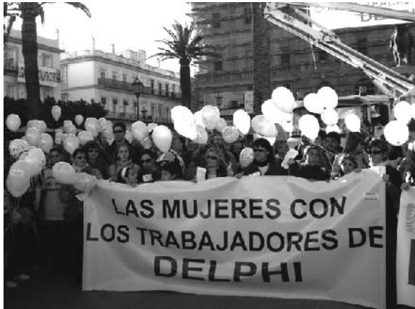
Cádiz, Spain — Women workers support Delphi Workers.

Then Delphi workers united with women garment workers from Dewherst, 400 of whom were fired for organizing a union. Both groups held joint demonstrations, and daily protests at the provincial governor's