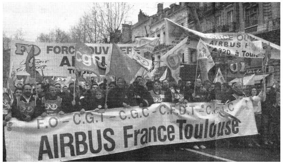
Airbus workers strike against mass layoffs.