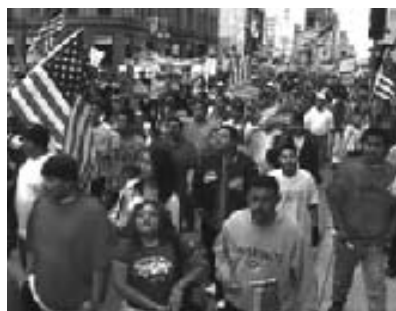
We need to win workers away from the racist, imperialist flag of the U.S. to the red flag of Communist workers' power!

All their hypocritical embracing of immigrants aimed to make them feel grateful and patriotic, to