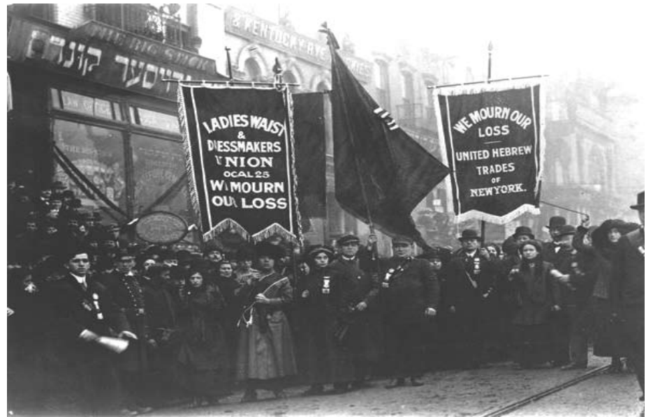
Workers march during the funeral of the victims of the Triangle Fire in New York City.

The end of the civil war has brought no social peace to workers here; violent criminal gangs are rampant (many formed in the U.S.). Conditions for workers in general are horrendous. Meanwhile the FMLN (the former guerrilla group now turned into the second largest electoral party) talks and talks, just offering a "reformed-capital-