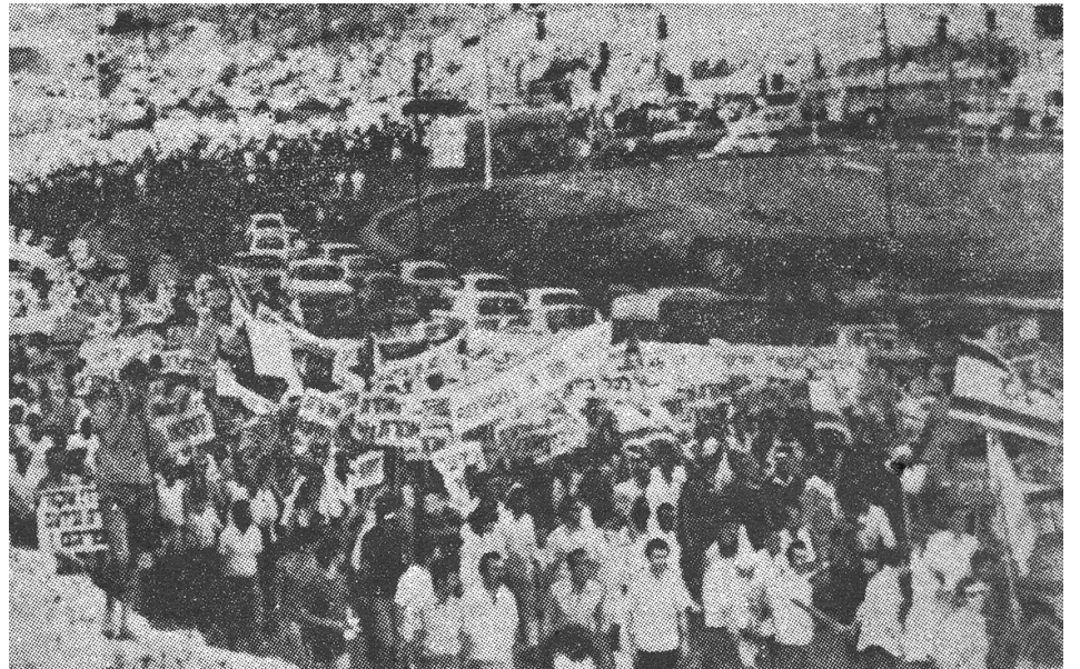
In one of the largest united Arab-Jewish anti-government demonstrations in Israel’s history, 3,000 Arab and Jewish workers marched across Jerusalem in September 1972 to the office of fascist Prime Minister Golda Meir protesting her refusal to allow residents of two destroyed Arab villages to rebuild their homes. ☺