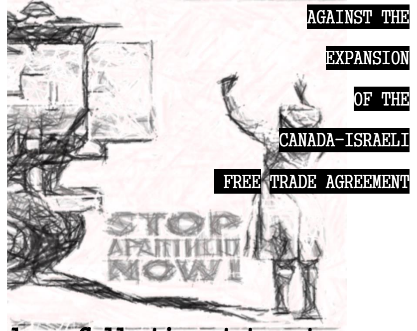
Tadamon Collective statement

Last fall, the Conservative government announced plans to expand the Canada-Israel <u>Free</u> Trade Agreement (CIFTA), a set of policies that serves to further legitimize Israeli occupation and apartheid, and deepen Canadian corporate and state involvement in Israeli racism and colonialism.