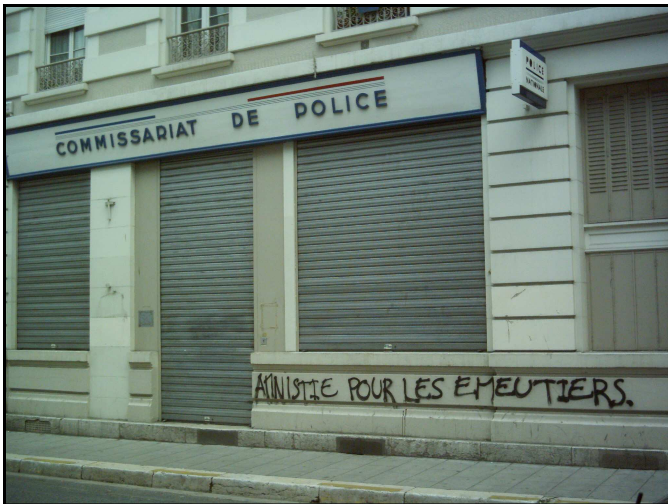
Police station in Saint-Bruno district (Grenoble), on April 18th 2006.

«When causing trouble for the police and more generally for advocates of public order, we can leave behind the usual feelings of resignation and powerlessness. Smashing things and turning the pacified town into a riot place is a form of creation, and conversely.»