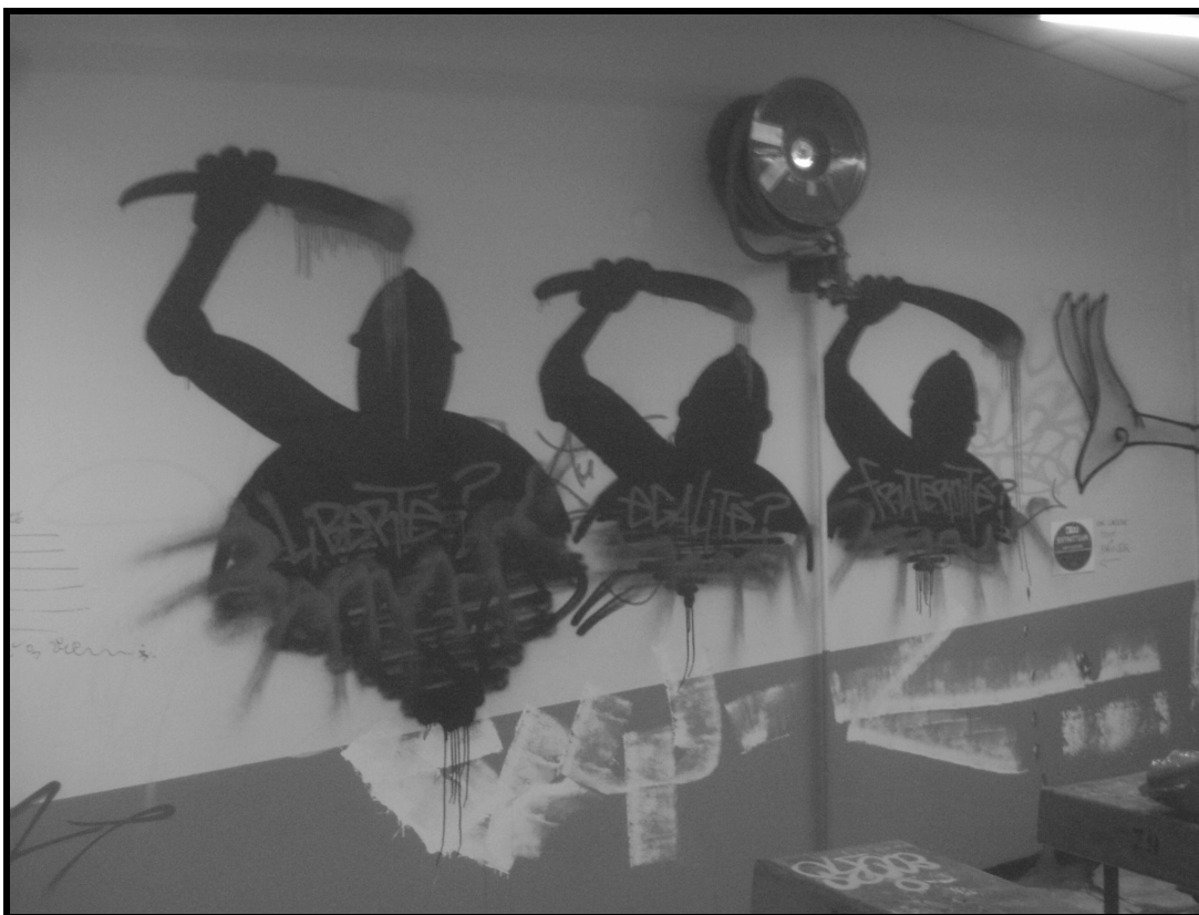
One of the walls the Amphitheatres Hall (Pierre Mendès-France University, Grenoble/Saint-Martin-d'Hères campus), on April 10th 2006.

More in-depth texts, all available in booklet format, ready to be printed, photocopied and wildly distributed.