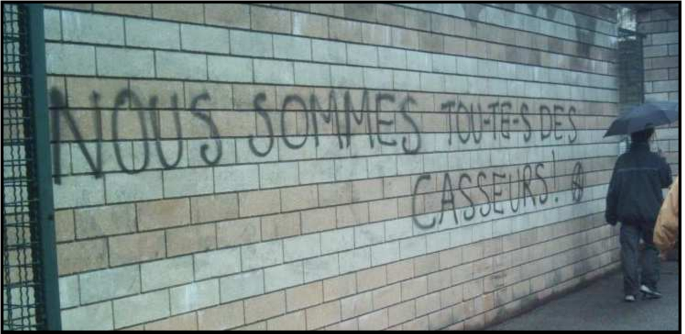
A wall in Grenoble, on March 28th 2006.

The insurrectional (and thus destructive) violence of the protesters bears the seeds of an exciting life to be built, a life reaching beyond mere survival (whichever style – working-class or middle-class, "western" or "third world"), a life taken back from the hands of state and bosses, abolishing the work-family-country-TV routine. The creativity residing inside this violence is the expression of an impatience to do away with the dispossession of our lives, the practical negation of the roles that we are supposed to stick to.