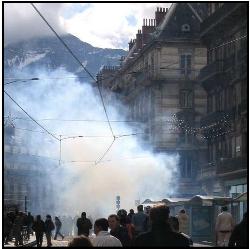
Tear gas in Victor Hugo Square, in Grenoble, on March 28th 2006.

to push back the angry protesters who had started indiscriminately stoning BAC and CRS cops (e) . From this day, the BAC guys would only come wearing helmets and keep well apart from the crowd. Consciousness and revolt were rising up.