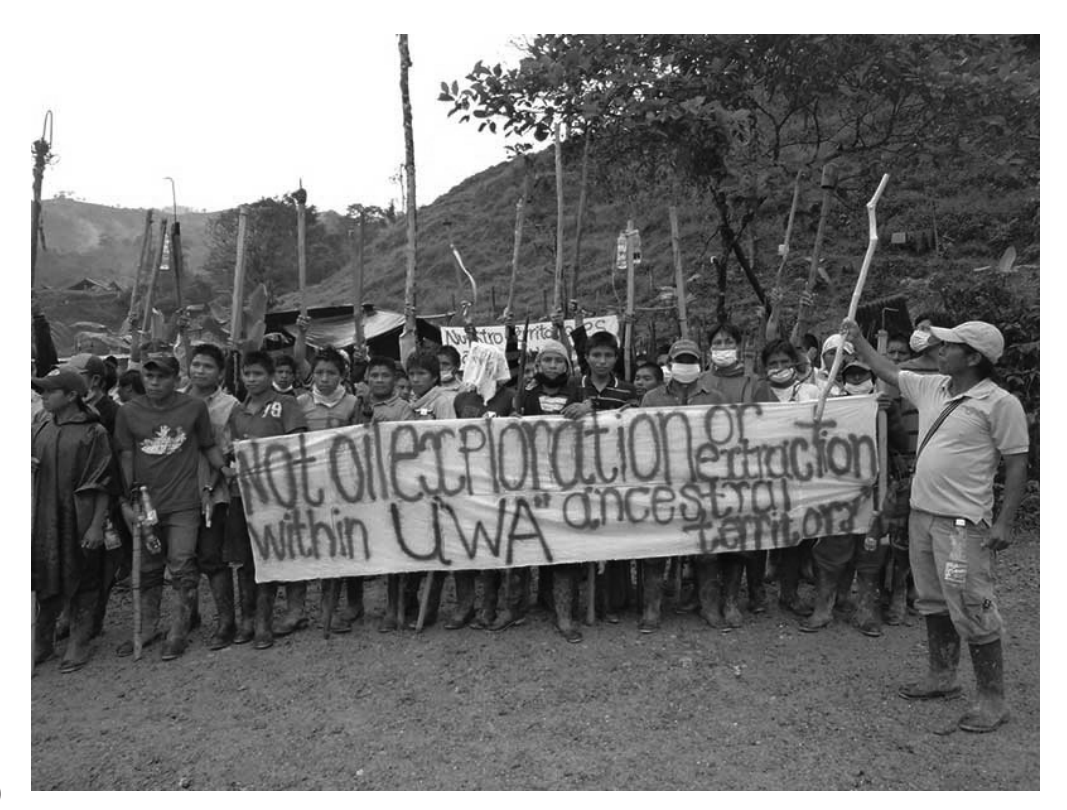
Late February, U'wa people hold a banner celebrating victory over the Megallanes gas project.