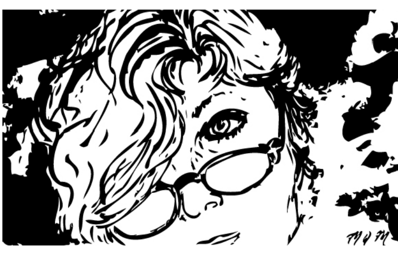
Check out Marius' new support fliers at SUPPORTMARIUSMASON.ORG