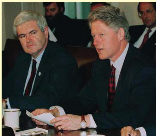
President Clinton and House Speaker Newt Gingrich face off over budget, 1995

Smithsonian non-essential staff were furloughed and the museums and National Zoo were closed to the public. A November 19 continuing resolution reopened the government, kept it funded at 75 percent of current levels, and paid Federal employees for the furlough days.