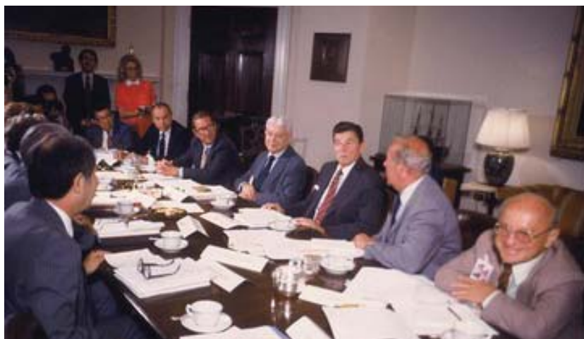
President Reagan with group of outside economic advisors, 1981

For the first time in U.S. history, a one-day government-wide furlough was ordered by President Ronald Reagan. Some 400,000 of 2.1 million Federal employees were furloughed. The Smithsonian sent home non-essential staff and closed the museums. Essential staff, such as guards, animal keepers at the National Zoo, and building engineers stayed on site. Employees were paid for the furlough day by the Federal government.