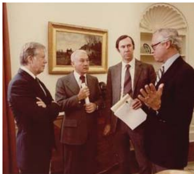
President Carter and Attorney General Civiletti (r) at the White House, 1980.

Prior to 1980, administrations cut non-essential spending (such as travel and new hires) and furloughed individual agencies when a Federal budget was not passed. The proposed balanced budget legislation in 1980, however, required broad, across-the-board closures of all government functions that left little flexibility to keep essential government functions running, such as air traffic control and Federal prisons. Thus,