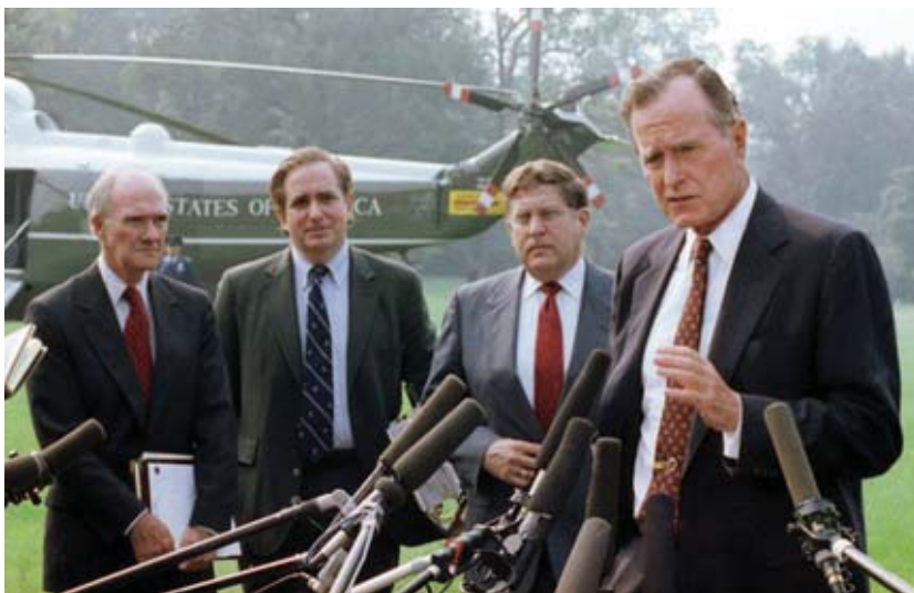
President George H.W. Bush leaves for budget negotiations, September 7, 1990, Government Executive, November 30, 2012

were not scheduled to work. The Smithsonian closed its museums for the three days, and the National Park Service