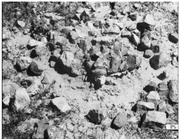
Top, Aboriginal silcrete quarry on an isthmus on the western shore of Lake Mungo in the Far West of NSW. Below, detail showing debris from tool making.