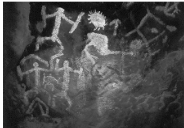
Ochre was mined by Aborigines for use in cave and body painting and for the decoration of artefacts. Ochre figures from a cave near Cobar

Mines were generally open cut, although some mines did extend underground. At Koonalda Cave in South Australia there is evidence that flint mining extended about 75 metres below the surface and up to 300 metres from the entrance of the cave.