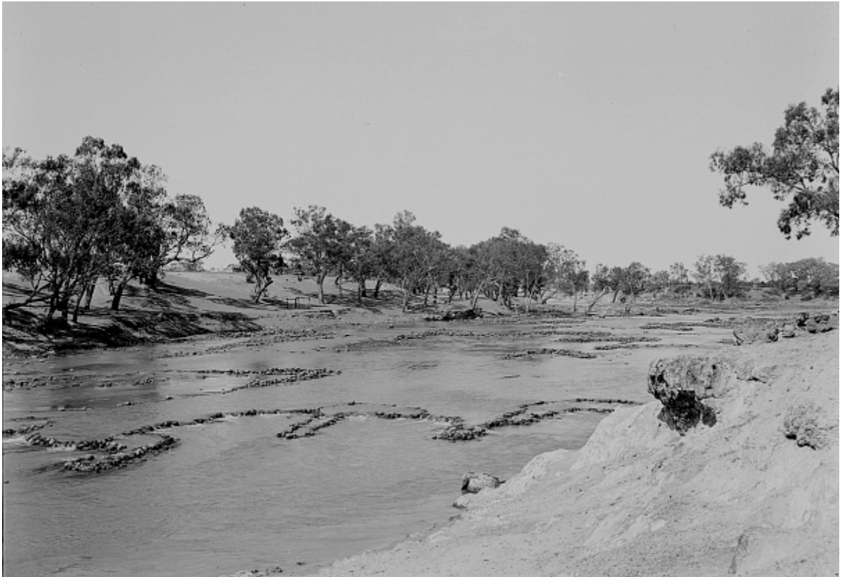
Aborigines used stone for building as well as for manufacturing tools. These stone fish traps were photographed on the Barwon River near Brewarrina by E.F. Pittman between 1874 and 1881