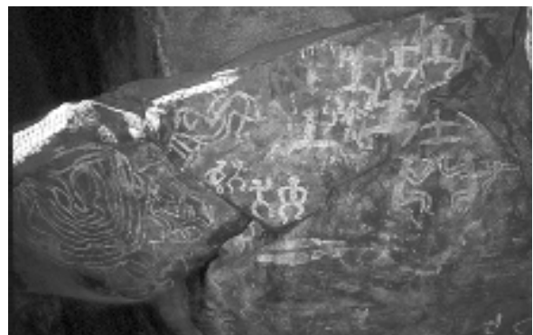
Ochre cave paintings. Top, hands from a cave north of Ulan in the Central West. Below, figures from a cave near Cobar

Axes and other cutting tools were typically made from volcanic and metamorphic rocks, which are hard and tough. Millstones and other grinding tools