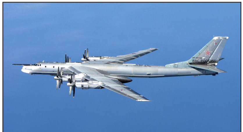
Russian TU-95 BEAR

One of our biggest challenges in the future will be gaining and maintaining freedom of action as our adversaries' capabilities rapidly advance. Advancing technologies can be an opportunity or threat. For example, for decades the U.S. enjoyed unimpeded freedom of action in the space domain. Today's space capabilities empower the Joint Force to operate globally with unmatched speed, agility, and lethality. Our adversaries understand this and are working hard to erode that advantage.