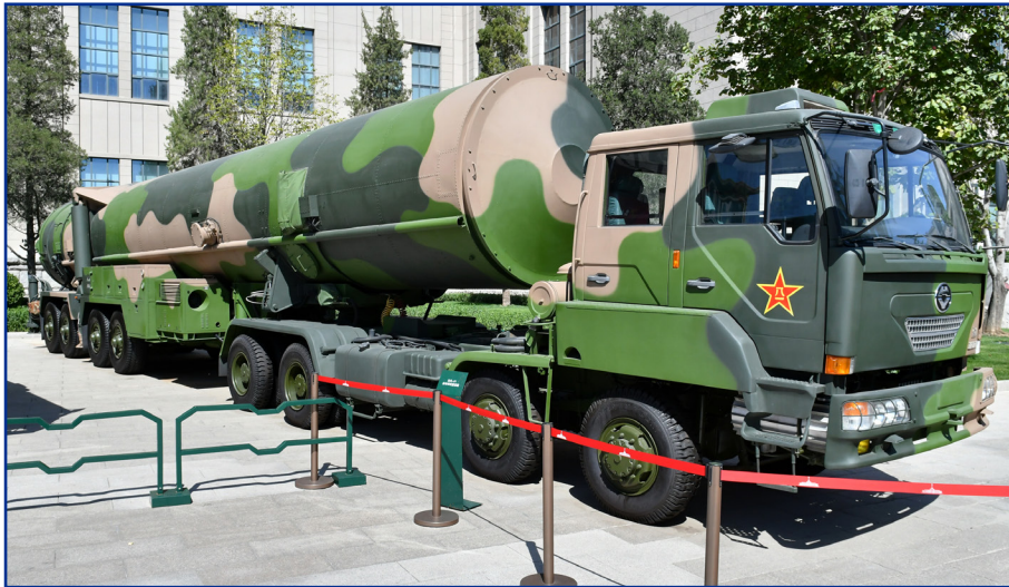
Chinese DF-31 Ballistic Missile

Today's strategic environment is dynamic, complex, and volatile. For decades, we held a military advantage over our adversaries, both from a nuclear and conventional standpoint. That is still true today, but it is rapidly changing. Globally, adversaries are openly challenging the international order through aggression, coercion, and subversion, and our Allies and partners are looking to us for leadership and security.