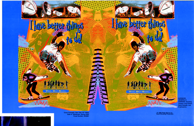
Youth Smoking Prevention—Philip Morris USA