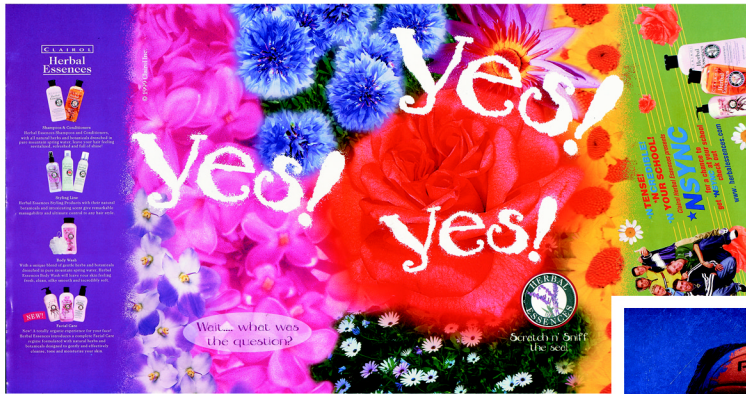
Clairol's Herbal Essences