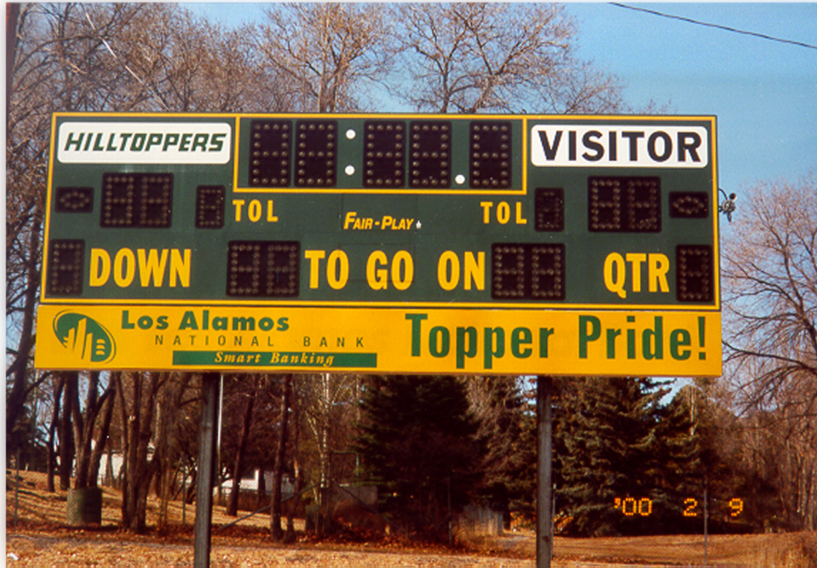
Figure 2: Ads on Scoreboards