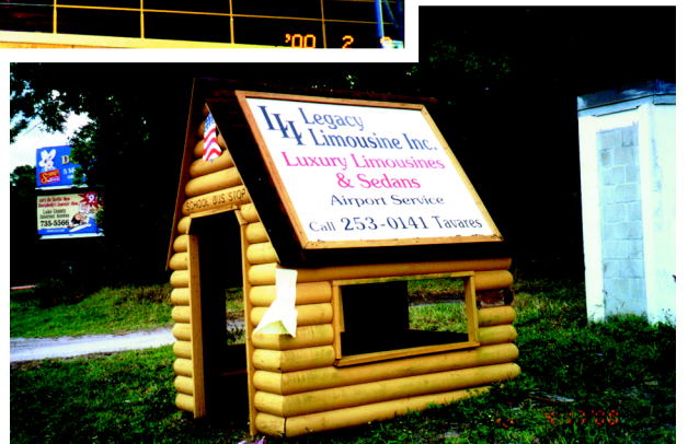
Ad on School Bus Stop