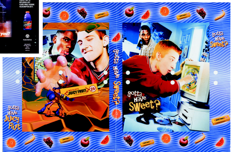
Juicy Fruit Gum