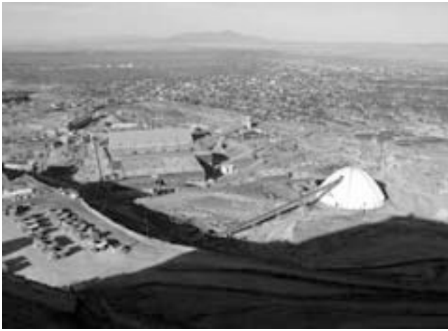
Figure 1—View from the control tower on top of the open-pit copper mine with the ore processing plants in the foreground and the town of Cananea.

nurse, an industrial hygienist, and a Mexican-American pulmonary technician), and a third industrial hygienist from Colombia. The OHS survey team spent a day and a half interviewing and testing mine workers, who were recruited by Local 65 of the Mexican Miners Union, at the miners' union hall in downtown Cananea. The afternoon of the second day was spent in a walk-through inspection of the open-pit mine and associated ore processing plants.