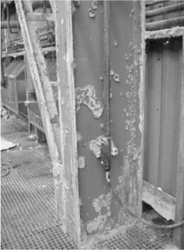
Figure 7—Lack of effective ventilation in the ESDE #2 building resulted in high levels of sulfuric acid mists which corrode structural steel beams supporting the roof.

The OHS survey team released its preliminary report in November 2007 in Mexico City. 14 Members of the team and national leaders of the Mexican Miners Union met with high-ranking officials from the STPS. The delegation urged the STPS to form a commission including representatives from the Mexican Department of Labor, Grupo Mexico, the Mexican Mine Workers union, the U.S. United Steel Workers union, the International Metalworkers Federation, and occupational health professionals from the MHSSN to visit and inspect health and safety conditions in Cananea to determine what remedial measures Grupo Mexico must undertake to provide a safe and healthful workplace for both the unionized and non-unionized workers. The following day, the STPS issued a statement declaring the OHS survey team's report was "not legally valid," as only the STPS is authorized to conduct OHS surveys in Mexico. 15