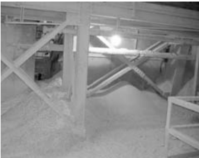
Figure 5—Piles of settled rock dust blocked passageways and emergency exits in the multi-building Concentrator department.

Workers were exposed to high concentration of silica-containing dust. Exposures to airborne silica can lead to