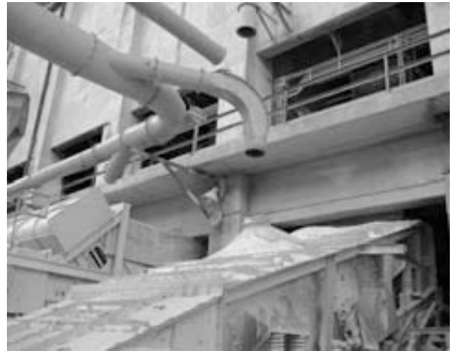
Figure 6—Disassembled ventilation systems in the Concentrator plants created worker exposures to airborne silica inside the buildings at levels at least 10 times the Mexican regulatory limit.

fatal respiratory diseases including silicosis and lung cancer. 12 At the estimated concentrations, and absent engineering controls to reduce dust levels, workers in the concentrator areas must be provided with powered air-purifying respirators (PAPRs), or supplied-air respirators operated in continuous flow mode. Grupo Mexico has provided only paper filtering face piece respirators. In addition, medical evaluation, fit testing, and training have not been provided to respirator users. Instead of installing engineering controls to eliminate or reduce exposure to airborne chemical hazards, the company has provided personal protective equipment (specifically N-95 respirators) only in the ESDE plant.