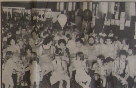
The picture shows the public attending one of the Sydney Socialist Festival functions held on November 24 at the Addison Road Community Centre. Despite unsettled weather the Festival was very successful and hundreds of people and children enjoyed a day of fun and activity. (For more pictures see page 12)