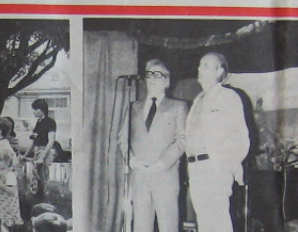
Speeches by the Deputy Editor of Pravda Yevgeni Gruzdev (above), the Editor of the Socialist, Alan Miller and SPA's President, Pat Canby.

Let us therefore step up the campaign for general and complete disarmament, the stopping of nuclear tests and the complete abolition of nuclear weapons. But do not confuse the undoubtedly grave dangers of nuclear weapons with the adequate development of the safe use of nuclear power. Don't throw out the baby with the bath water! It may be that in certain countries, such as Australia and New Zealand, it will be possible to meet energy requirements without nuclear power. In that case the problem need not arise locally. But in my view the worldwide energy crisis will not be solved, in the short term without its use. The demand then, on a world-wide scale, must surely be for the development of safe nuclear power, not for its prohibition.