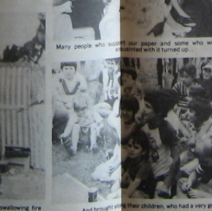
And brought along their children, who had a very good time. Circus performers who delighted everyone.

The despensing of the energy which may indeed constitute the greatest real threat of the outbreak of a third-world war. Nuclear power, with the full safeguards outlined above, is the only feasible new source of energy that could contribute significantly to the amelioration of the situation in the next few decades.