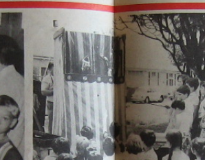
Purchased Judy shows for the kids.

The truth is that the world will need nuclear power to tide us over the next half century. It should be able to use solar power on a large scale, with consequently much less danger of environmental pollution than with coal, oil or other fossil fuels. Also, the prospects for the development of nuclear fusion power which uses a form of water as basis fuel and produces comparatively little radioactive contamination, appear promising. But most authorities assess the really large scale application of these technologies as forty or fifty years away.