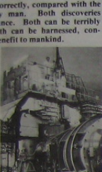
The atom can help humankind. The picture shows a staff of nuclear research in Ukraine, USSR.

As a result of often ignorant and uninformed reporting, irrational fears of the dangers of nuclear power have been built up in the minds of the public. No accident that could happen to a nuclear power station could be in any way comparable in hazard with the radioactive fallout resulting from atmospheric tests of nuclear weapons; and yet, China continues to test nuclear weapons in the atmosphere without much public outcry. An accident to a nuclear power station could not produce a conventional type explosion, not a nuclear explosion. If the explosion took place in the middle of a big