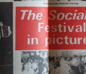
Many people who support our paper and some who were just getting disappointed with it turned up.