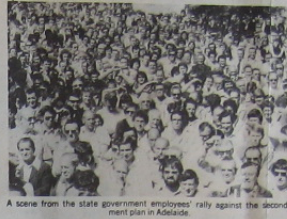
A scene from the state government workers' rally against the secondment plan in Adelaide.

The most astonishing revelation is the fact that for the first time in Australian legal history a police informer, Mr