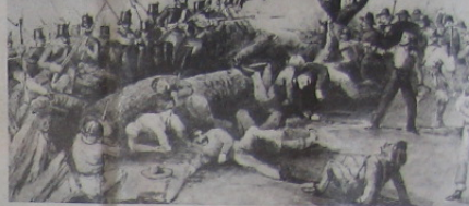
Miners defending the Eureka Stockade

In 1854, the diggers on the Victorian gold fields rebelled against imposition of a 30/- a month licence for what it was — an attempt to limit and regulate the goldfields and back to them and, in the final analysis, to try to drive them off the goldfields and back to having no choice but to offer