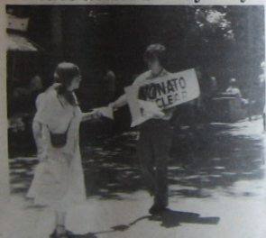
An Australian Peace Committee member giving out leaflets during the APC demonstration held in Martin Place, Sydney against NATO plans to 'keep up the arms race.'

On November 27, the Australian Peace Committee (APC) responded to the World Peace Council's call for world-wide protests against the Gtreats to peace.