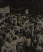
Part of the crowd who attended the ALP rally against uranium.