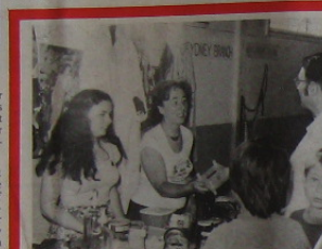
The Sydney Socialist Festival offered all sorts of activities for grown up and children alike. There were many stalls such as the one we see above...

releasing materials got into the water supply. But it would be the blindest criminal folly to locate a nuclear power station near a built-up area. If the worst possible accident occurred at a nuclear power station in a remote area the danger could almost certainly be contained locally. One could imagine freak conditions of gale force winds at the same time which might carry the radioactivity further, but proper technology, the chance of an accident, in the first place, is exceedingly remote.