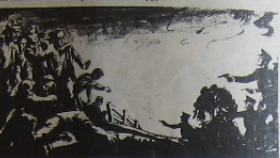
An artist's impression of the Rothbury shooting.

The Rothbury tragedy has not been forgotten by Australian workers and the Miners Federation will hold a commemorative ceremony at the diggers' demand for the Freeman's Waterhole Miners Memorial on Sunday, December 16.