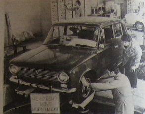
While capitalist economy sinks deeper in crisis the USSR looks ahead with confidence. The picture shows workers at a factory in Moscow.

For many years the incomes of farm workers have been growing at a higher rate than those of the other categories of workers. In November 1, 1979, the figure reached nearly 80 per cent. Substantial changes have also taken place in the structure of the people's diet. Annual per capita meat consumption has increased by more than 15 kg and reached about 60 kg. It should be taken into account, however, that in the