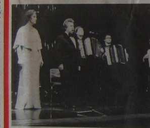
A magnificent group of Soviet performers thrilled the audience with popular and revolutionary songs from the USSR.