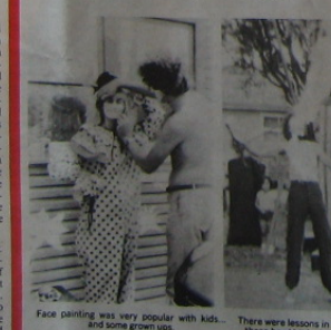
Face painting was very popular with kids and some grown ups. There were lessons in extinguishing fire those had hit by food price rises.

To go back to our comparison with the fire danger; perhaps the most devastating civil accident involving fire would be the fully laden jumbo jet should crash on a football stadium during a cup final. With proper and available nuclear technology the probability of these two happenings seem comparable. If we accept the latter, it is irrational to regard nuclear power generation, operated with the safeguards described above, as an unacceptable hazard.