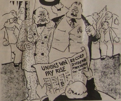
Dammit gentlemen! The unions are threatening our democracy. They must be smashed!