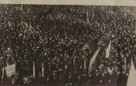
Prague, February 1948. People jubilantly demonstrates in favour of the socialist government just installed. They are not going to allow now a handful of CIA collaborators to put back history.

"The socialist system in Czechoslovakia produced a high quality in the concept of freedom. The working people are in complete charge of the