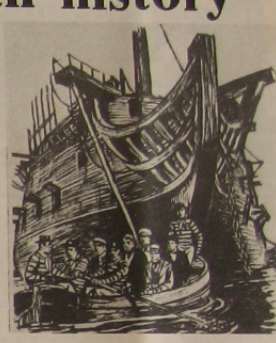
A boat with convicts arriving in Australia

The onset of the scientific and technological revolution in its great expansion of the productive forces of the productive force. This ownership of the means of production by these vast forces an explosive contradiction demanding the replacement by new, socialist relations of production. The conclusions reached by Marx in formulating this basic