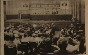
All important questions are decided collectively, while individual responsibility is fixed for carrying out decisions.

Party organisations shall ensure regular and efficient checks on decisions.