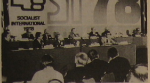
The Socialist International founded its study group on disarmament in 1976. Social-democratic parties are showing increasing concern with the arms race. The picture shows a meeting of the Congress of the Socialist International held in Vancouver in 1978.

wards universal and complete disarmament under effective international control, said Mr Sorsa. He welcomed the signing of SALT I as a satisfying historic step in the process of establishing control over strategic armaments, which will begin with delay on new quantitative and especially qualitative limitations of strategic armaments. Mr Sorsa said that during meetings with the President of the United States, with the UN Secretary General and representatives of the non-aligned countries the Socialist International had received a resolute appeal for détente and disarmament. "We make a similar appeal to all Moscow. Knowing your long-standing commitment to the policy of détente, we are convinced that we shall get the most positive response from you."