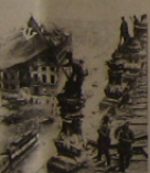
The Red Army has a proven record as a defender of people's freedoms. This is the Red Army's role in the Reichstag in Berlin in April 1945.

There were those from the British Board of Deputies foaming at the mouth with indignation to "Let them leave," their demanding the fact that