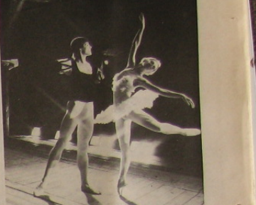
Arts fourth in the GDR

The announcement that the ballet company of the Comic Opera in Berlin, the capital of the GDR, would be performing at the Adelside Festival of Arts in 1980 once again highlights the remarkable achievements of the GDR in its 30 years of existence. Once again a GDR cultural ensemble is in demand everywhere.