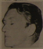
Fraser Workers are coming out strongly against his policies.

main thrust of the Fraser Government's policy is to make the working class bear the full brunt of the government's economic mismanagement. It seeks to achieve this aim by shattering trade unions through the implementation of anti-worker legislation.