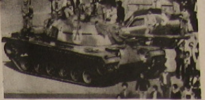
Tanks in the streets of Seoul after Park's killing. South Korea's ruling class and US imperialism got rid of Park in an attempt to stop popular unrest.

In Pyongyang the newspaper Pyongyang Shin writes that the 7th Fleet Flagship Blue Ridge and aircraft carrier Kitty Hawk to Pusan. The 3,000 American troops stationed in the south of the Korean peninsula have been put on the alert.