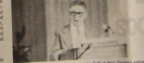
George Jackson, General Secretary of the SUP of New Zealand addresses those who are prepared to oppose the policy of the Muldoon Government.

The letter ends calling the Federal Government to adopt a more realistic foreign policy perhaps at the cost of long term isolation of Australia in the Indo-China peninsula.