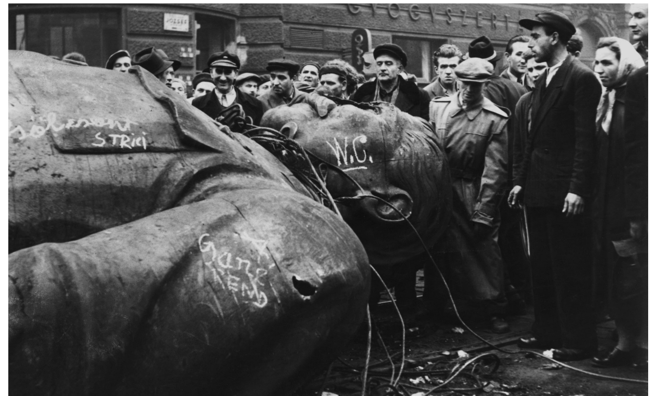
Hungarians stand over the toppled statue of Joseph Stalin on October 23, 1956