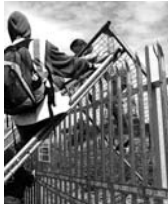
Protesters using one fence to scale a second fence at the power station

Police said they had arrested 100 protesters & charged 46. A spokesman for EON said the protesters had not affected its power output. There was debate within the movement & opposition raised by mining unions over the camp’s focus on opposition to coal.