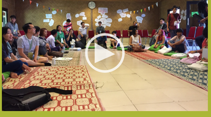
Coconet summary video (long)