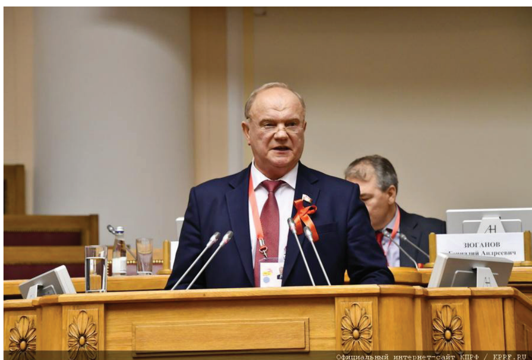
Официальный интернет-сайт КПРФ / KPRF.RU