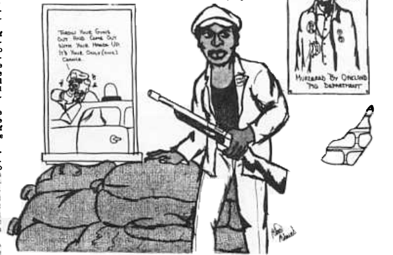
THE CHOICE IS UP TO US AND WE WILL HAVE TO DECIDE QUICKLY.

At this point in the struggle of the community and divide it into several smaller parts: divide and conquer. A new police station is being built at the base of Warren Street, near Dudley Street Station. Among other things the new pig along with reinforced steel and concrete, two stories of which is not going to kill or even injure Black people can move along in response to the actions of the racist, fascist pigs are either acceptance or resistance - Either we are going to accept the systematic extermination of Black people and go to the gas chambers and ovens voluntarily, or we are going to resist this move by the fascists and begin to deal with the question of survival: intergration, separation or segregation, but survival. Who is going to survive America? This is the fundamental question that faces us as a people and we must deal with it as a people with one goal in mind: national salvation. If we look all around us and examine the things that we see happening around us