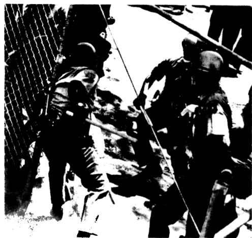
WE MUST PREVENT A FASCIST STATE IN AMERICA

against the oppressed and the base upon which capitalism builds the fascist state, the pig mercenary police force.