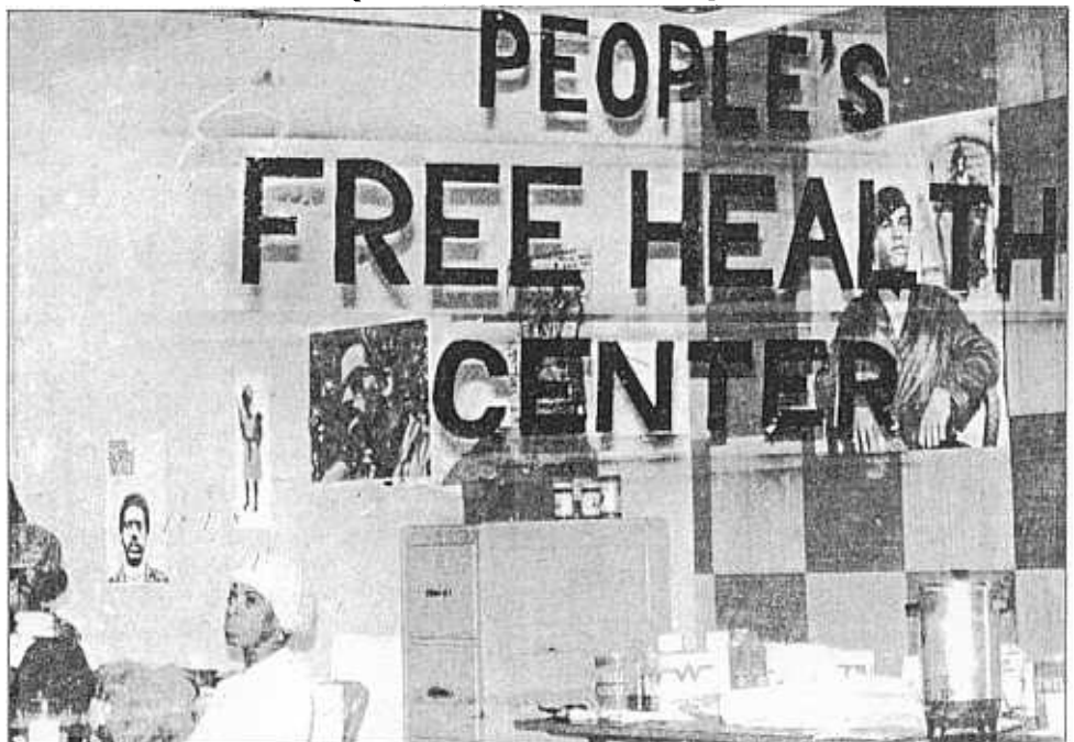
A free health clinic was one of many Survival Programs operated by the New Haven BPP Chapter.