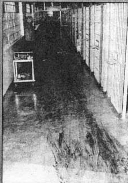
San Quentin Prison, August 21, 1971.

“The failure of the court to reverse my conviction is a flagrant miscarriage of justice”