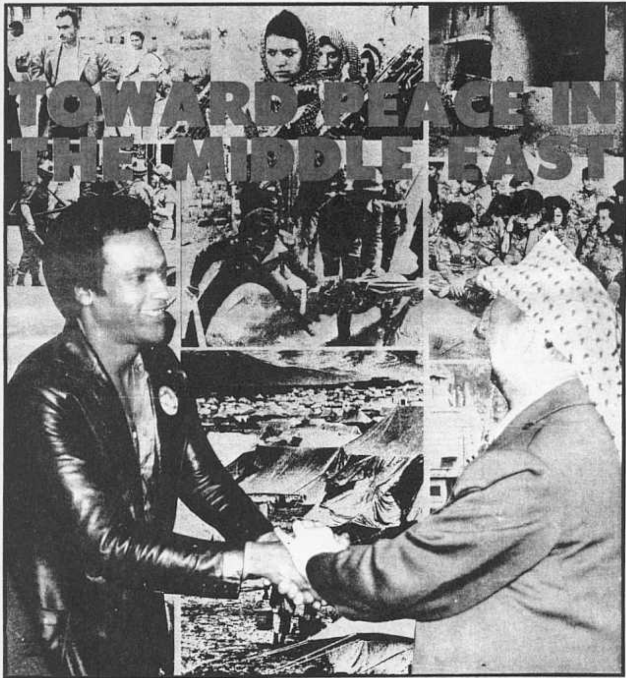
Black Panther Party President HUEY P. NEWTON and PLO chairman YASIR ARAFAT. (See pages 6-9.)