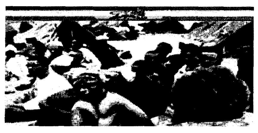
An Abyssinian Slave Market, prepared as a Post Card for Oromo Remembrance Day.

Between 1850 and 1870, the French historian Martial de Salviac estimated the Oromo population to be about 10 million. In 1900 he reported that only half had survived the Abyssinian war of occupation (Melba, 1980). Similarly, Gelmo Abbas, an Oromo historian, reported indiscriminate killing of Oromos in the Arsi region by Abyssinian King Menilik II.