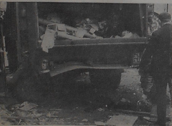
Bomb in Belfast