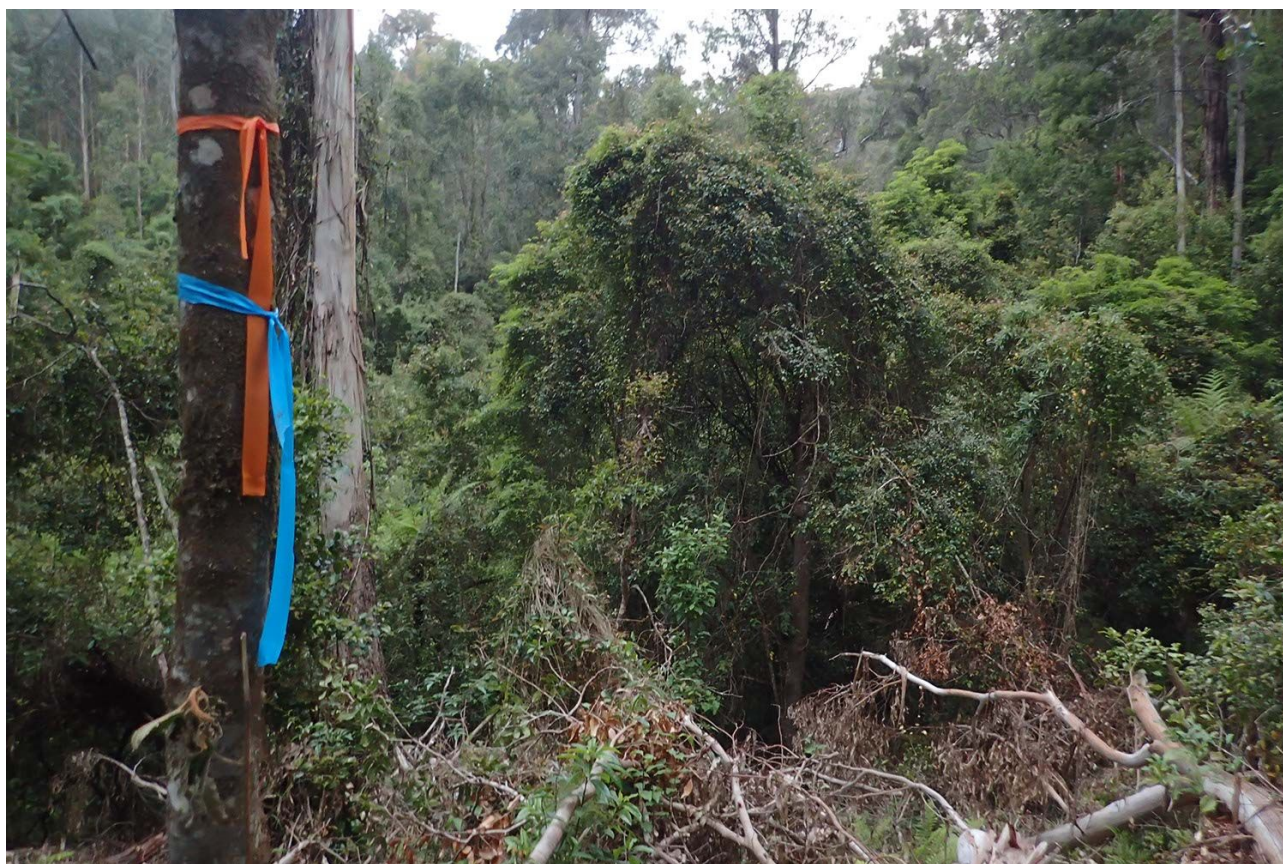
Figure 2. Coupe demarcation tapes placed at edge of Warm Temperate Rainforest (55H 0662553 5840063)