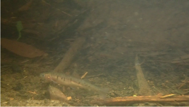
Figure 1(b). Galaxias aequipinnis at 55 H 657972 5842679 (GDA94 UTM)