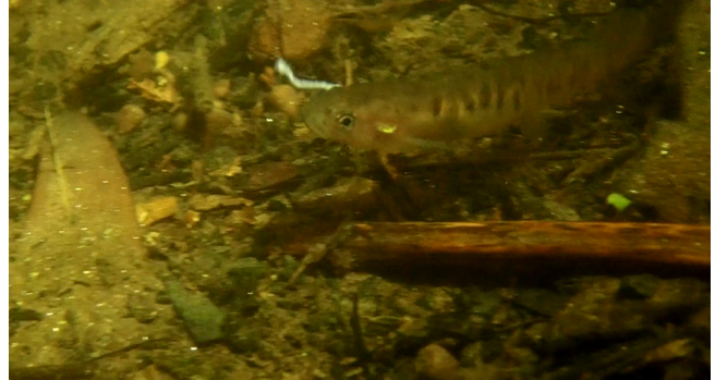
Figure 1(c). Galaxias aequipinnis at 55 H 657972 5842679 (GDA94 UTM)